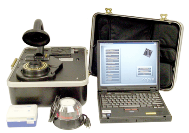
Figure 2-1. Idaho Technology Inc.'s R.A.P.I.D.® 7200 Instrument

The ITI 1-2-3 Flow Kit is a three-step DNA extraction and purification kit that contains the components for purifying DNA from water or other environmental matrix. It removes inhibitors from a sample that would adversely affect a reaction and has been optimized for purifying DNA from difficult-to-process anthrax spores, as well as non-spore forming bacteria. Each kit is