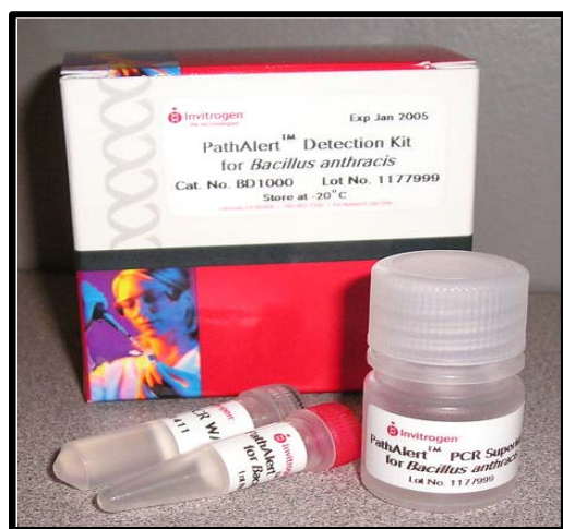
Figure 2-1. Invitrogen Corporation's PathAlert™ Detection Kit

The PathAlert™ Detection Kit is a multiplex polymerase chain reaction (PCR) reagent system capable of detecting F. tularensis , Y. pestis , B. anthracis , or smallpox in individual assays. The PathAlert™ Detection Kit comprises an optimized PCR SuperMix specific to the pathogen of interest, as well as an external positive control (EPC) template for system validation. The kit includes Taq polymerase, pre-complexed with antibodies to maintain “hot start” PCR (for specificity and sensitivity); uracil deoxyribonucleic acid (DNA) glycosylase and deoxyuridine triphosphate to eliminate post-PCR cross-contamination; and an internal positive control (IPC) to identify potential PCR inhibition from sample contaminants or environmental samples. Included in the kit is an EPC that has been engineered to produce different amplicon sizes than either the IPC or the pathogen-specific loci. As a result, pathogen-specific results can be read with minimal interference if contamination by the external control should occur.