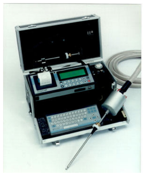
Figure 2-1. ECOM A-PLUS

The ECOM A-PLUS is designed for a variety of applications: boiler/burner flue gas analysis; engine emissions analysis; pollution source testing; and environmental reporting of stack gas parameters, among others. Measuring ranges are oxygen (O_2) , 0.0 percent to 21.0 percent; carbon monoxide (CO), 0 to 4,000 ppm and/or 0 to 40,000 ppm; nitric oxide (NO), 0 to 4,000 ppm; nitrogen dioxide (NO<sub>2</sub>), 0 to 500 ppm; and sulfur dioxide (SO<sub>2</sub>), 0 to 4,000 ppm. The A-PLUS