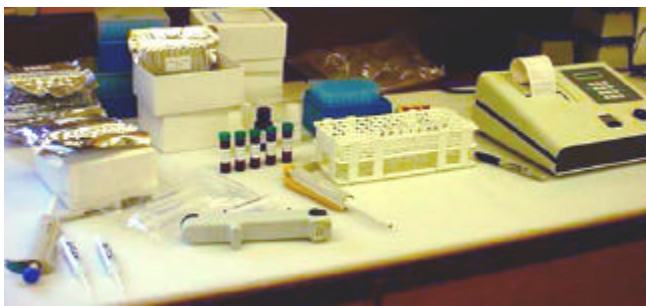
Figure 2-1. Beacon Analytical Systems, Inc. Atrazine Tube Kit

Since the same number of antibody binding sites are available in each tube and each tube receives the same number of atrazine-enzyme conjugate molecules, a low concentration of atrazine in a sample allows the antibody to bind many atrazine-enzyme conjugate molecules. The result is a dark blue solution. Conversely, a high concentration of atrazine allows fewer atrazine-enzyme conjugate molecules to be bound by the antibodies, resulting in a lighter blue solution.