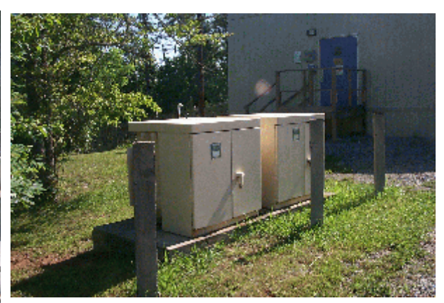
Figure 5-4. Transformers at ORNL containing oils with PCB concentrations greater than 50 ppm.