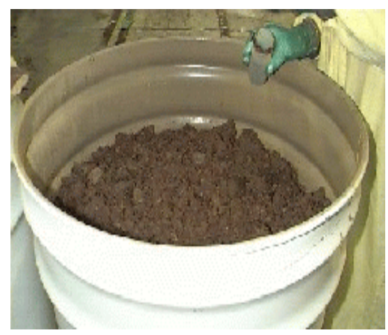
Figure 5-1. K-25 personnel collect a PCB sample from a 55-gallon drum.

Soil was collected from the top of the drum and placed in a plastic bag. The soil was then sifted by hand to remove rocks and other large debris, and placed in a plastic-lined 5-gallon container. Figure 6-2 shows the samplers performing this procedure. The amount of soil collected half-filled the 5-gallon container, amounting to approximately 12 kg of soil. Once the sifting was completed, the plastic liner was then removed from the container. To homogenize the soil sample, the liner was rolled on the ground in a back and forth motion, such the sample was kneaded and thoroughly mixed. Two 40-mL amber vials were fill with the homogenized soil for preliminary analytical characterization. A third sample was taken for total radiological activity screening. Paducah soil