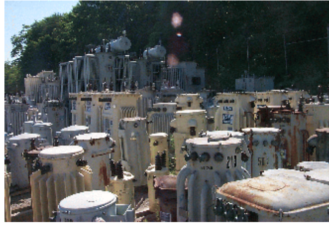
Figure 5-3. Transformer yard at ORNL.

The oil samples did not require homogenization. The samples, contained in 4-oz glass jars, were split into 10-mL aliquots using a disposable plastic syringe. The samples were randomized and labeled similar to the soil samples (described in Section 5.1.3). As mentioned previously, most of the native concentrations of total PCBs in the environmentally-contaminated oil samples were less than 50 ppm. Several of the transformer oils were augmented with additional Aroclors (up to ~200 ppm), so that a larger dynamic range could be tested. To spike the samples, approximately 250 mL of oil was poured into a 1-L wide-mouth jar. A stir bar was added, and the jar was placed on a magnetic stirrer. With the oil being stirred, hexane solutions of known concentrations of Aroclors were added to increase the total PCB concentration. A single Aroclor was added to specific transformer oils. The specific augmented concentration levels are described in Section 7.