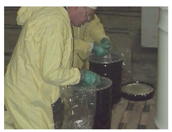
Figure 5-2. K-25 sampling personnel sift through the collected soil to remove rocks and other large debris.

The two analytical samples taken of each field-homogenized soils were analyzed by ORNL-based Grand Junction, Colorado (ORNL-GJ) field team who performed a preliminary on-site analyses of the PCB-contaminated soils. In Appendix B is presented ORNL-GJ's analytical procedures. ORNL's Chemical and Analytical Sciences Division (CASD) also performed preliminary characterization of the PCB-contaminated soils using a similar procedure. The total PCB concentration was measured in each analytical sample to determine which samples would be used in the verification. Results from the total activity screening indicated that the soils were not considered radioactive.