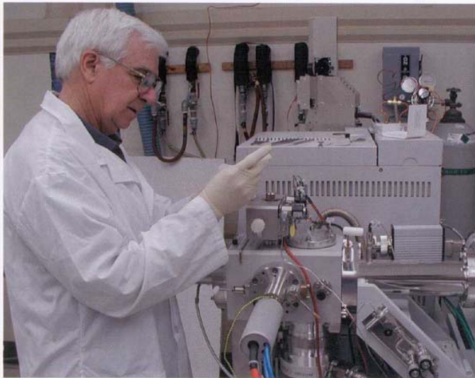
Figure 5. At its Environmental Health Laboratory, CDC scientists use several types of high-resolution mass spectrometry to analyze human tissue and fluid samples. The equipment shown here is being used to measure dioxin levels in a sample of blood serum.