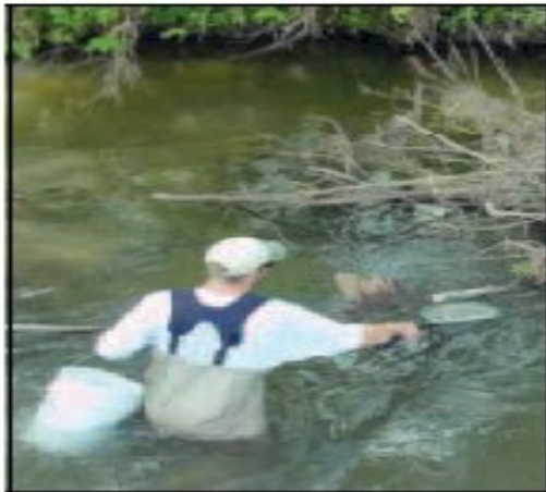
FISH KILL CLEANUP A DNR employee scoops a trout from Willow Creek soon after the spill was reported one year ago this July.