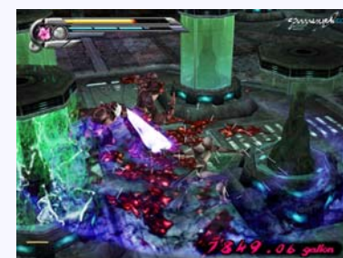
Nanobreaker for PS2