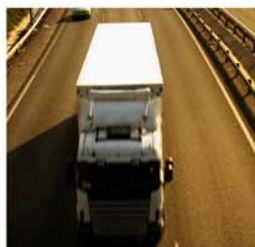
When trucks are not driving, idle reduction devices can reduce fuel use and emissions

The Department of Commerce was able to fund 118 more devices than they originally anticipated. Through this project, 471,770 gallons of diesel fuel are saved annually, and 781,000 hours of idling are reduced annually.