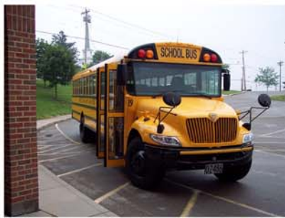
One of 60 new school buses meeting 2007 diesel emission standards

This grant targeted these pre-1993 buses for replacement. Seven school districts agreed to partner in the grant project and committed to accelerate the replacement of 60 pre-1993 school buses (33 were pre-1990 buses) with new, cleaner emission buses meeting 2007 emissions standards. In addition, the purchase of these 60 buses helped stabilize job preservation in the school bus manufacturing and associated industries and injected $4,627,827 into the economy.