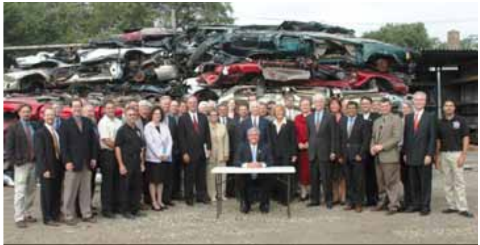
National Vehicle Mercury Switch Recovery Program Signing Ceremony

Finally, we set up the program to give every participant, and the public at large, a tremendous amount of information about how the program is really working, giving everyone the opportunity to verify results and weigh in on how to improve them.