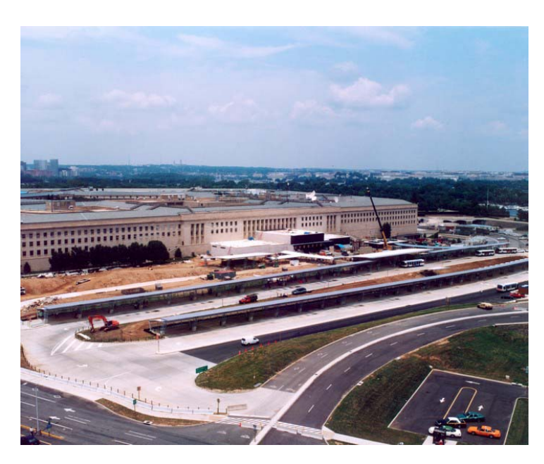
The Pentagon Renovation Project's unique acquisition approach, rewards the contractor design-build team for meeting LEED criteria, innovative construction and project management techniques and other factors that lead to successfully completing the most complex renovation project ever attempted by the federal government.

An increasing number of agencies and departments are turning to the USGBC's LEED<sup>TM</sup> rating system as the basis for their green design and construction activities. LEED<sup>TM</sup> is a sophisticated checklist covering five areas of environmental impact: energy and atmosphere, water efficiency, materials and resources, indoor environmental quality, and sustainable sites. A sixth category, innovation and design process, offers points for creative approaches to sustainable construction. The more points that a building gains based on its design and construction, the higher the rating, ranging from LEED<sup>TM</sup> Certified to LEED<sup>TM</sup> Silver, Gold, or Platinum.