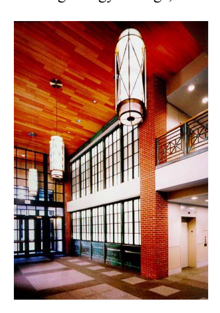
Renovation of Building 33 at the Washington, D.C. Navy Yard was a pilot project for the Navy's sustainable development program; and features sustainable and environmental design concepts, including lifecycle cost analysis.

A larger and more serious barrier to green building is the budgetary structure of the Federal government. The bottom line is that the long-term savings that a green building can generate, based on energy and water efficiency, potential productivity gains, and other factors, are not factored into the budgeting equation for building construction and renovation. Budget decisions are made on an "initial cost" basis—what it costs to build or renovate a building—rather than "life cycle costs"—how much initial construction or renovation decisions could cost or save over the 30 to 100 year life of a building, considering energy savings, reduced maintenance, and other factors.