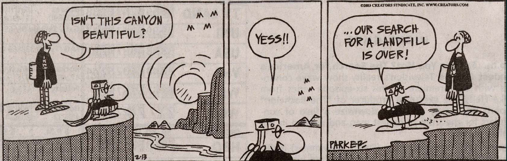
WIZARD OF ID by Parker & Hart