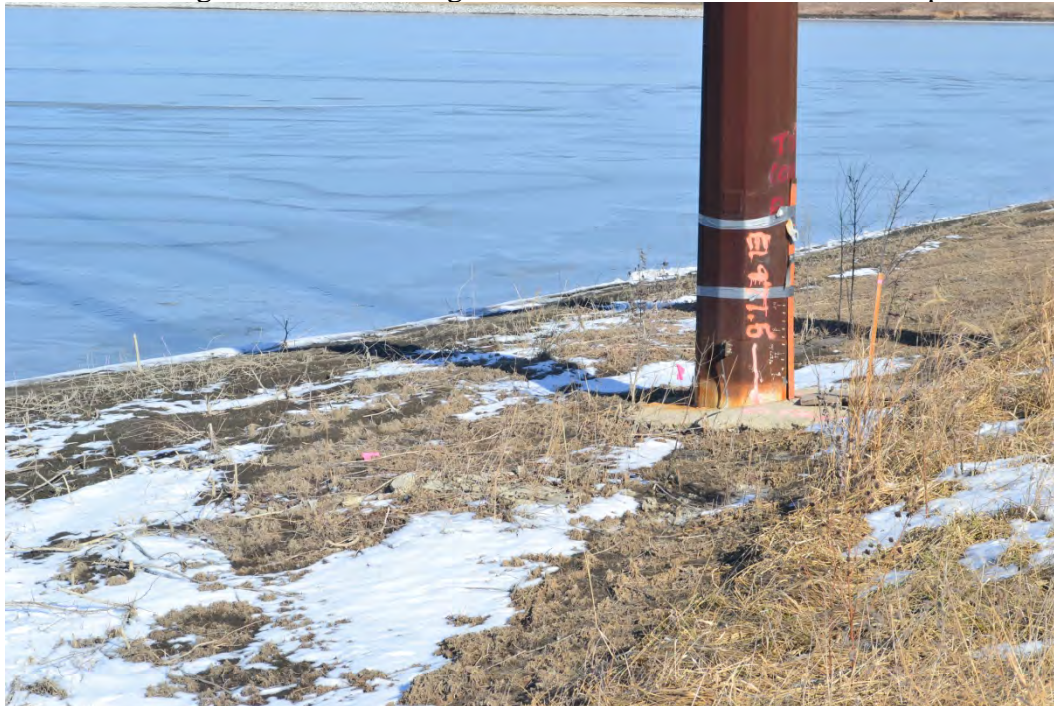
Photo 8 – Facing northwest showing southeast bank of South Surface Impoundment

Section 8.1: The report indicates that “Water is discharged through the outlet structure to Pony Creek”. This statement is not accurate, and should be changed to “Water can be discharged through the outlet structure to Pony Creek”. While the capability exists, water has not discharged through this outlet structure in many years.