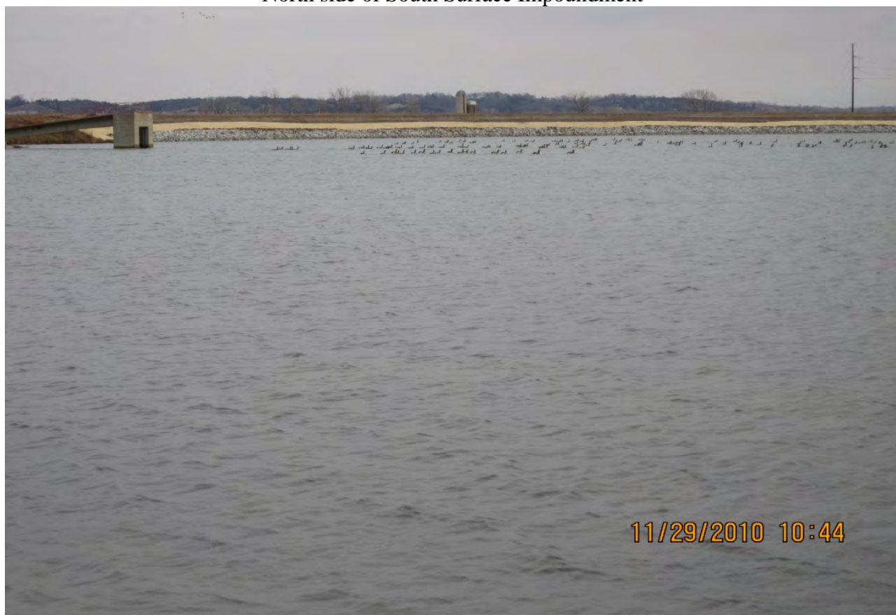
Photo 4 – Placed rip-rap to protect wave erosion action North side of South Surface Impoundment

Section 1.2.6: The facility continues to make periodic inspections and repairs as necessary to address pond-side slope erosion caused by wave actions on the South Surface Impoundment on the north and south sides. The facility is also monitoring wave action on the northeast corner of the North Surface Impoundment and will make a further assessment on placement of rip rap for wave erosion protection in late spring 2011. Photographs 4-7 detail the repairs made to the South Surface Impoundment following the on-site inspection in September 2010.