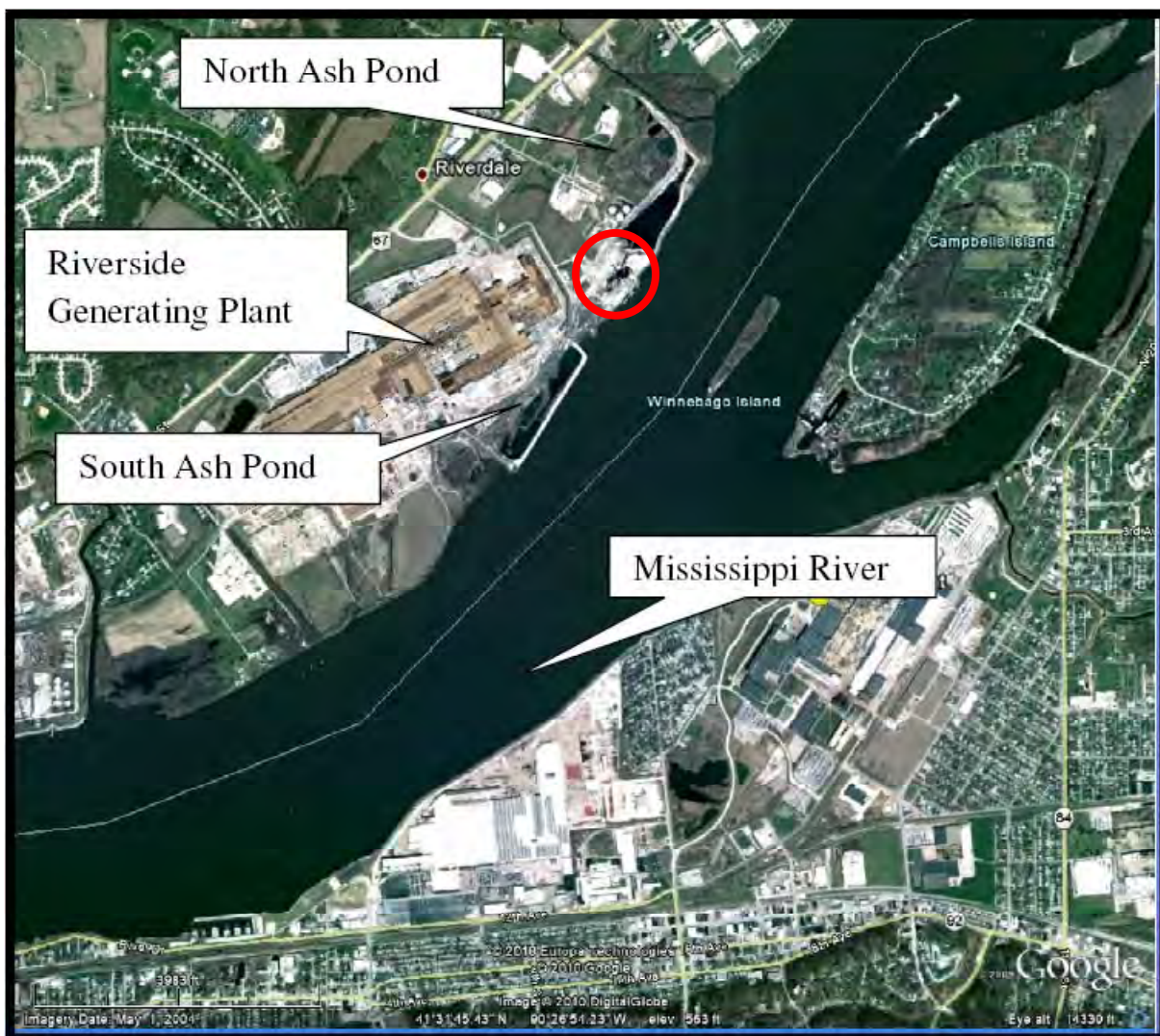
Figure 2.1-2: The photo incorrectly labels Alcoa as the Riverside Generating Plant. Riverside is actually just north of the South Surface Impoundment (South Ash Pond) as shown in the red circle below.

Section 1.2.1 & 1.2.3: On January 14, 2011, Terracon performed a seismic analysis of the Riverside South Surface Impoundment. The report, provided in Attachment J, demonstrated results of global stability factors of safety ranging from 1.28 to 1.37; well above required minimum factor of safety range from 1.0 to 1.1. MEC submitted these reports to Dewberry on January 25, 2011, but it does not appear that the report results were included in the draft report documentation. Please utilize these report results in your final assessment for the Riverside facility.