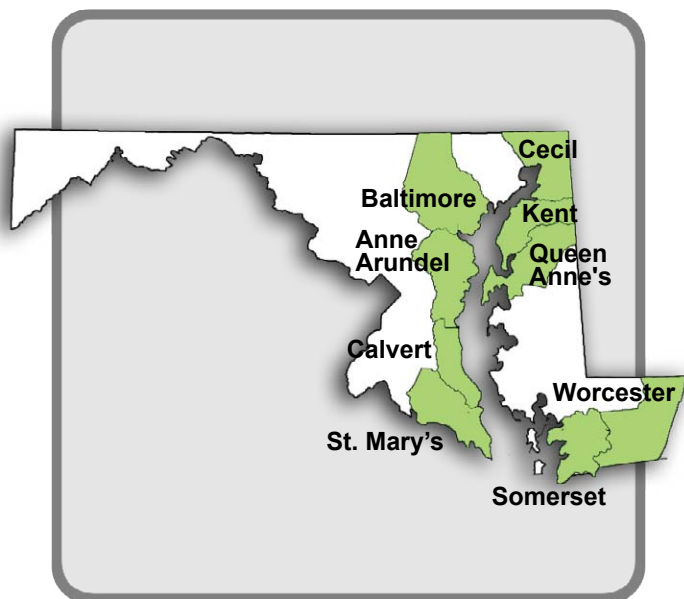
Table 1. Breakdown of monitored and unmonitored coastal beaches by county for 2009.