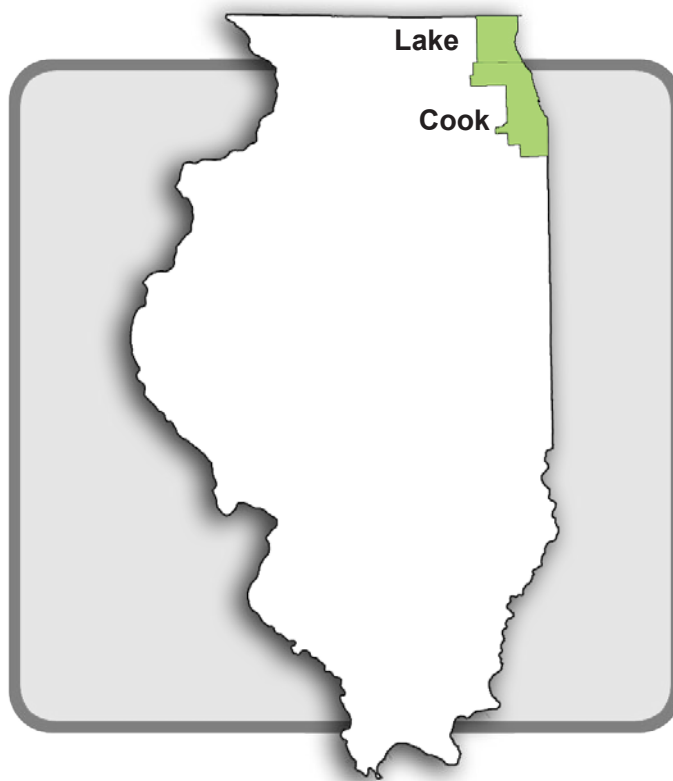
Table 1. Breakdown of monitored and unmonitored coastal beaches by county for 2009.