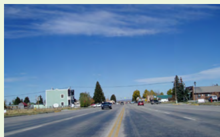
Victor, Idaho before improvements

The City of Victor found a way to begin implementing these concepts with minimal funding. They worked with the Idaho Transportation Department to add bike lanes and diagonal parking spaces, narrowing travel lanes, calming traffic, and increasing transportation options for residents and customers of local businesses. This simple investment set the stage for attracting the downtown activity that residents want and demonstrated to developers that revitalization is a priority for the City. Through its Envision Victor effort, the community is exploring other ways of implementing the options presented by the technical assistance.