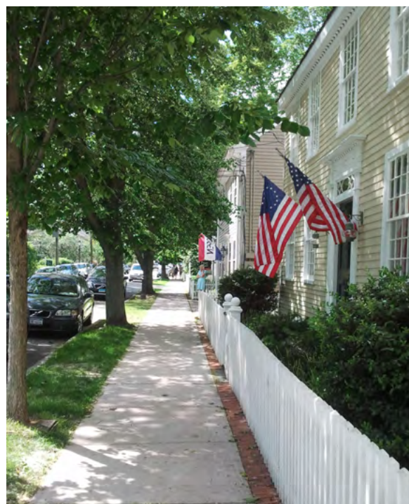
Essex, Connecticut, courtesy of EPA

www.hud.gov/offices/cpd/communitydevelopment/programs