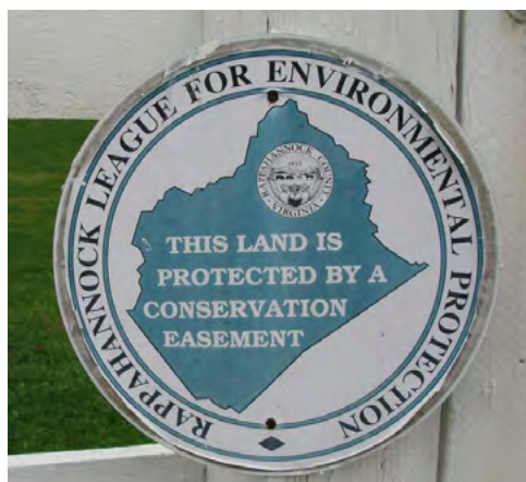
Rappahannock County, Virginia

Conservation Technical Assistance helps individuals manage natural resources such as soil, water, and wildlife. This program provides a broad array of assistance, including the conservation planning that must occur before an application for financial assistance from another program is approved and technical assistance to help individuals comply with regulatory requirements. No application is necessary; the program delivers assistance as needed to landowners, conservation districts, tribes, states, local jurisdictions, and others.