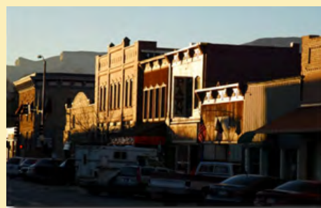
Rifle, Colorado

The Colorado Department of Local Affairs received a TIGER II Planning Grant and a HUD Community Challenge Grant to help three small communities—Fowler, Monte Vista, and Rifle—pursue a unique joint planning initiative to revitalize their downtowns. The work will include creating construction-ready design drawings for the renovation of historic buildings and planning for development that will increase walkability, transportation choice, and energy efficiency.