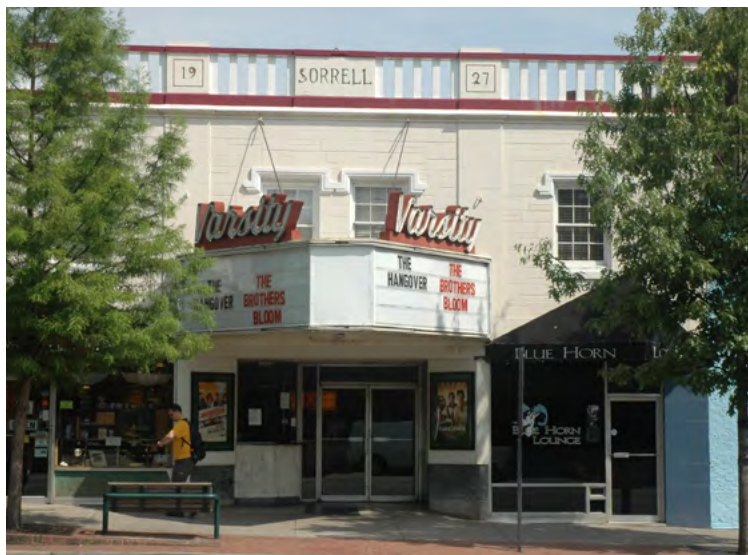
Chapel Hill, North Carolina

State and Tribal Response Programs oversee assessment and cleanup activities at the majority of brownfield sites across the country. This non-competitive grant program can support the development of a response program's regulations or procedures, the purchase of environmental insurance, the capitalization of a Revolving Loan Fund for brownfields cleanup, and other activities. Funding goes directly to states and tribes. Depending on state and tribal priorities, communities may be able to access some of the funding for their own environmental insurance, technical assistance, or other capital needs.