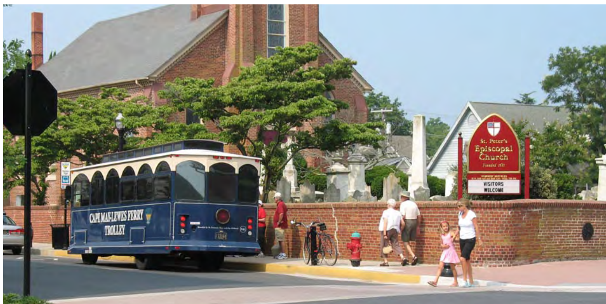
Lewes, Delaware

Easter Seals Project ACTION (Accessible Community Transportation in Our Nation) is a national technical assistance project to encourage and facilitate cooperation between the disability and transportation communities, with the goal of achieving universal access to transportation for persons with disabilities nationwide. This project is funded through a cooperative agreement with FTA.