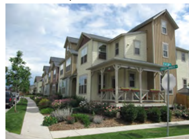
Edwards, Colorado

Mortgage Insurance for Residential Care Facilities is provided on loans made by FHA-approved lenders to purchase, refinance, construct, or rehabilitate housing for the frail elderly in need of supportive services. This type of housing can include nursing homes, assisted living facilities, and board and care facilities. Proposed projects are evaluated on the basis of whether they are acceptable insurance risks for the FHA Insurance Fund. This is not a competitive process.