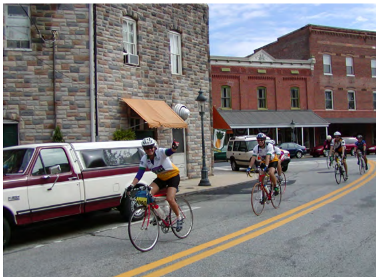
Berlin, Maryland

www.fhwa.dot.gov/environment/recreational_trails/index.cfm