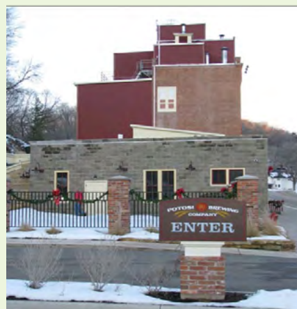
Potosi Brewery

Southwestern Wisconsin regional and local leaders are combining multiple federal funding sources to strengthen the economy, create jobs, and capitalize on assets such as the strong agricultural sector. Through Project Produce, funded by a USDA Rural Business Opportunity Grant, they are exploring the feasibility of scaling up fruit and vegetable production on existing family farms and creating tools to help growers explore new markets in the region. This project was born out of a five county planning effort, Grow Southwest Wisconsin, which is funded by a HUD Sustainable Communities Regional Planning Grant and dedicated to making the area a place that the coming generations will want to live in. Several catalytic projects have also been implemented in the region. For instance, state brownfields funding, Scenic Byways funding, and a USDA Business & Industry Guaranteed Loan were used to revitalize the Potosi Brewery, a historic brewery along the Mississippi River that now provides jobs and serves as a tourist destination and local amenity.