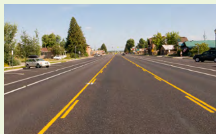
Victor, Idaho after improvements, courtesy of City of Victor