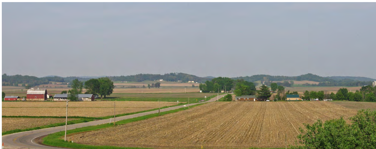
Galesville, Wisconsin