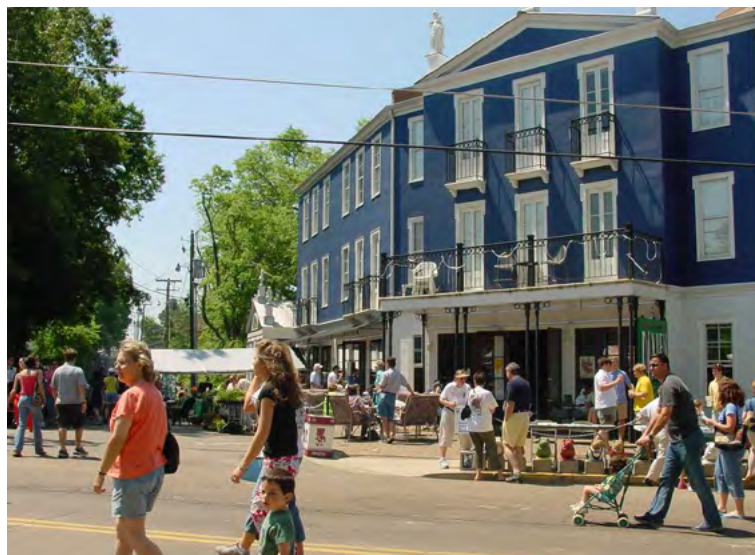
Starkville, Mississippi

The ENERGY STAR for New Homes Program certifies new homes that meet certain energy efficiency standards. Builders sign on as partners with EPA and then work with certified experts to incorporate energy-efficient features into their homes.