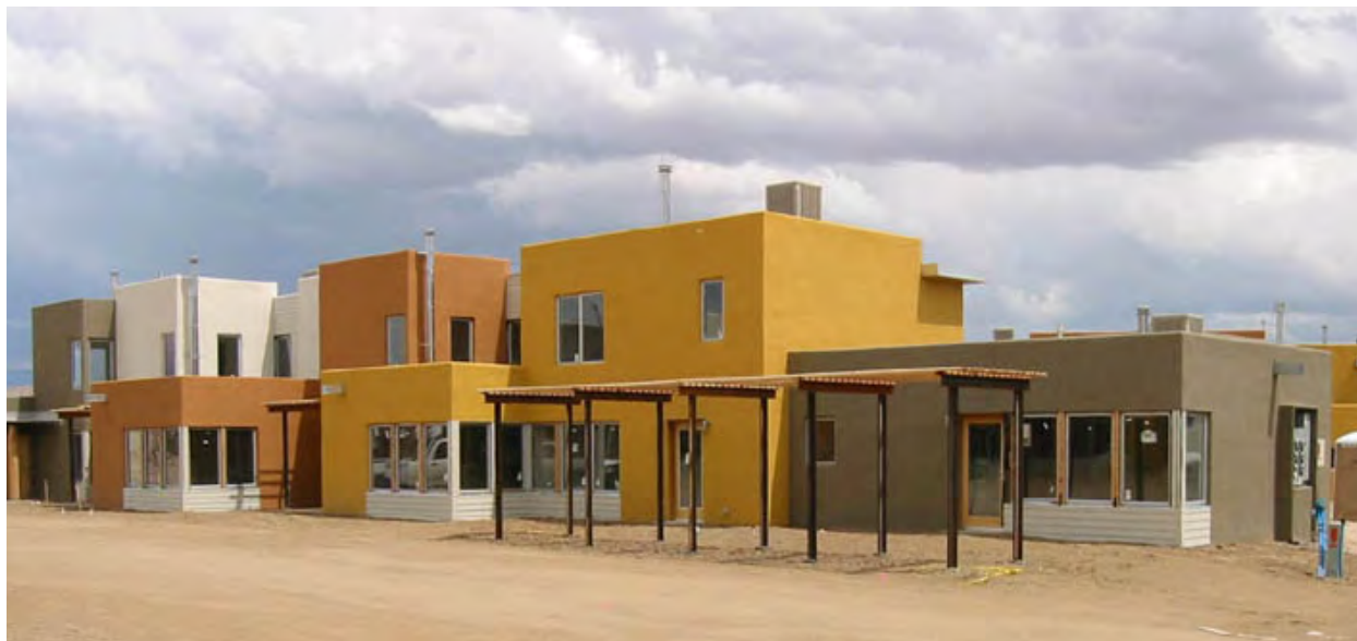
Tsigo Bugeh Village, New Mexico