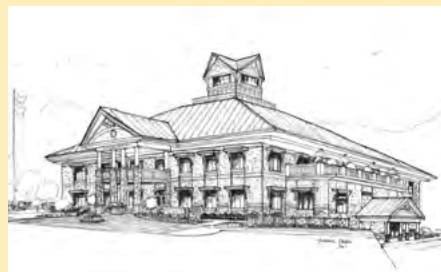
Future Fletcher Town Hall

The town rezoned the site for downtown development, put property tax incentives in place to attract developers, and received a $350,000 grant from the North Carolina Department of Transportation to build an access road. Additionally, the town was awarded a $5 million Community Facilities loan from USDA Rural Development to construct a 25,400-square foot Town Hall and Public Safety Building to anchor the Heart of Fletcher district.