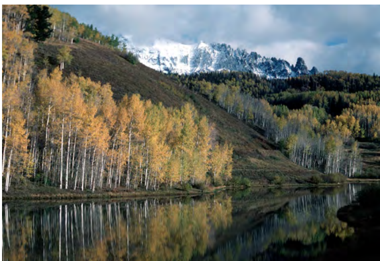
Colorado, courtesy of NRCS

The Farmers' Market Promotion Program provides grants to help communities support direct producer-to-consumer opportunities such as farmers' markets, roadside stands, community supported agriculture, and agritourism. Grants increase access to local foods by low-income consumers, allow growers to market their products directly to consumers, and raise awareness of local products through promotion and outreach.