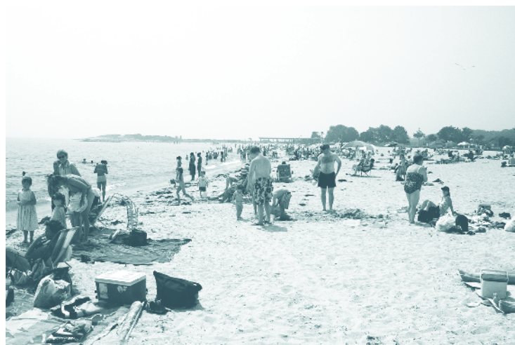
Ocean Beach Park, New London, Connecticut.

Because the grant draws a sharp distinction between supposing and knowing, we knew