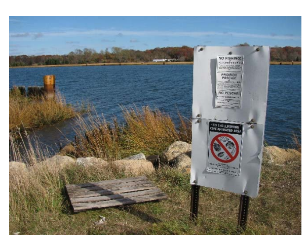
New Bedford Harbor in Massachusetts is contaminated with PCBs from decades of industrial pollution.

At the genetic level, the tolerant Atlantic killifish populations evolved in very similar ways. This adaptation suggests that these fish already carried the genetic variation before the sites were polluted, and that there may only be a few evolutionary solutions to pollution.