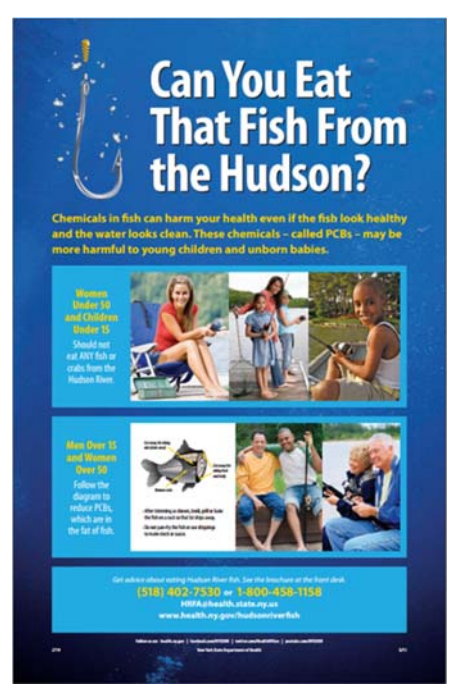
Can You Eat That Fish From the Hudson?

An 11 x 17 inch poster, ideal for waiting rooms orcommunity bulletin boards.