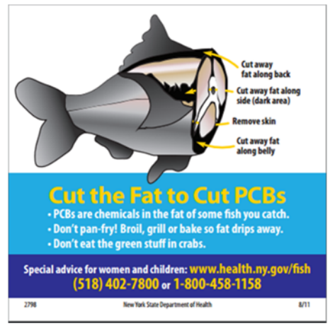
Cut the Fat to Cut PCBs.

A 20-page activity book for classrooms, waiting rooms, and Hudson River community events.