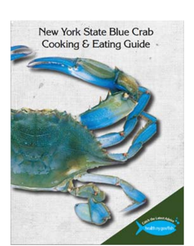
New York State Blue Crab Cooking & Eating Guide.

This 4x4 inch refrigerator magnet shows how to reduce PCB levels in a fish meal by skinning and trimming fish before cooking.