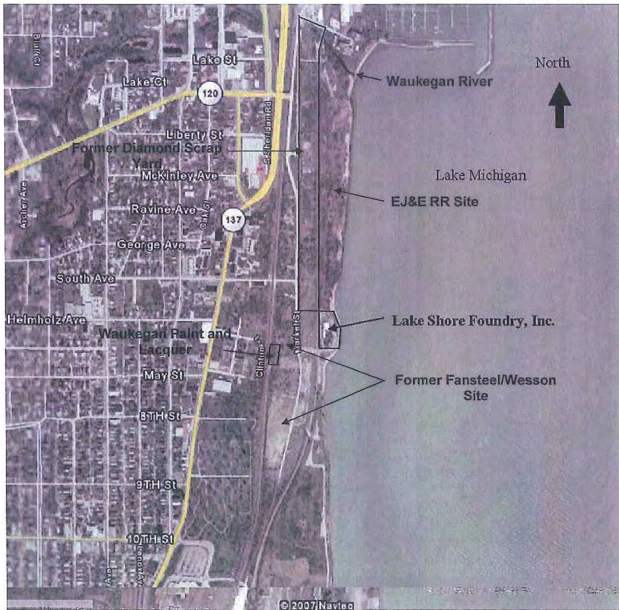
Figure 1 Site Location Map Lake Shore Foundry, Inc. 653 Market St., Waukegan, Lake County, IL. 60085