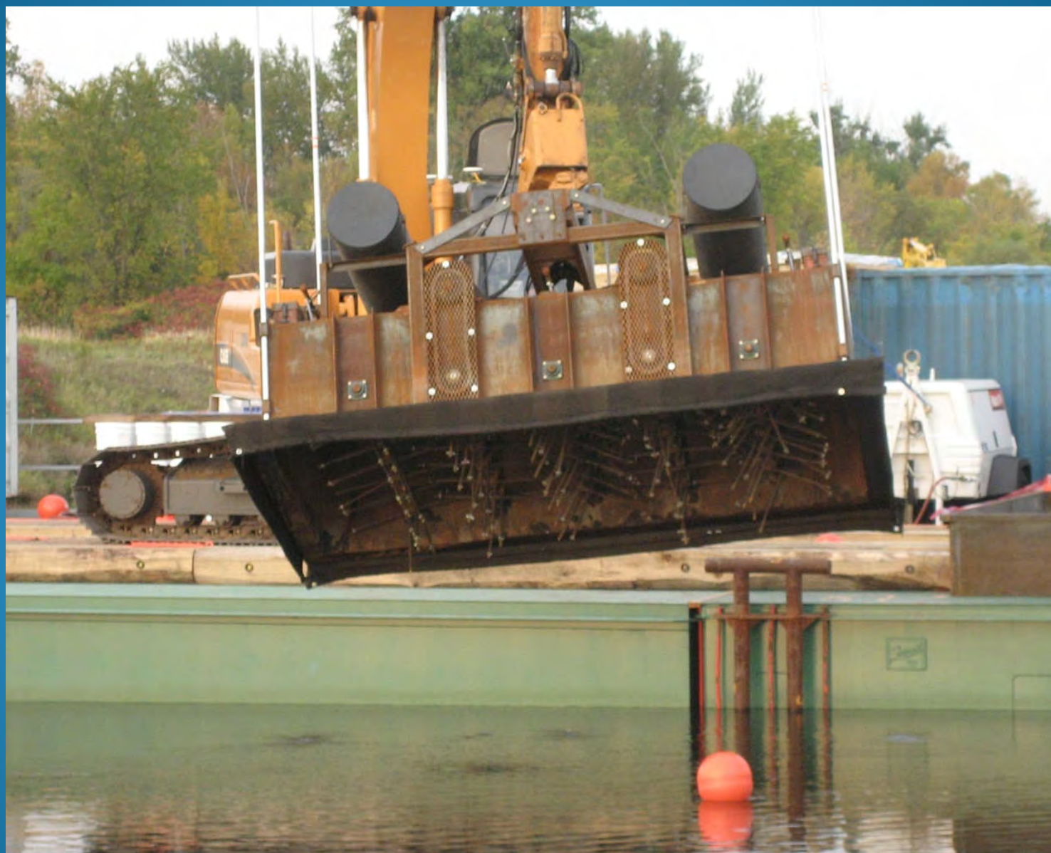
2006 Activated Carbon Pilot Study – carbon tiller/mixer