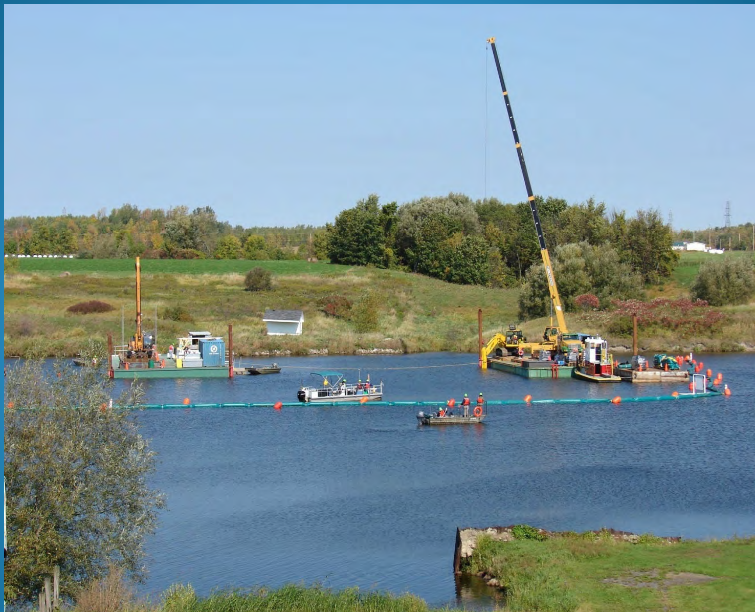
2006 Activated Carbon Pilot Study