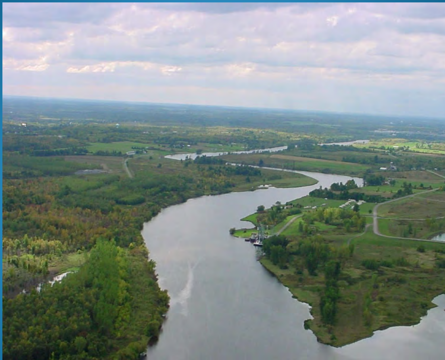
Lower Grasse River – looking upstream from the mouth