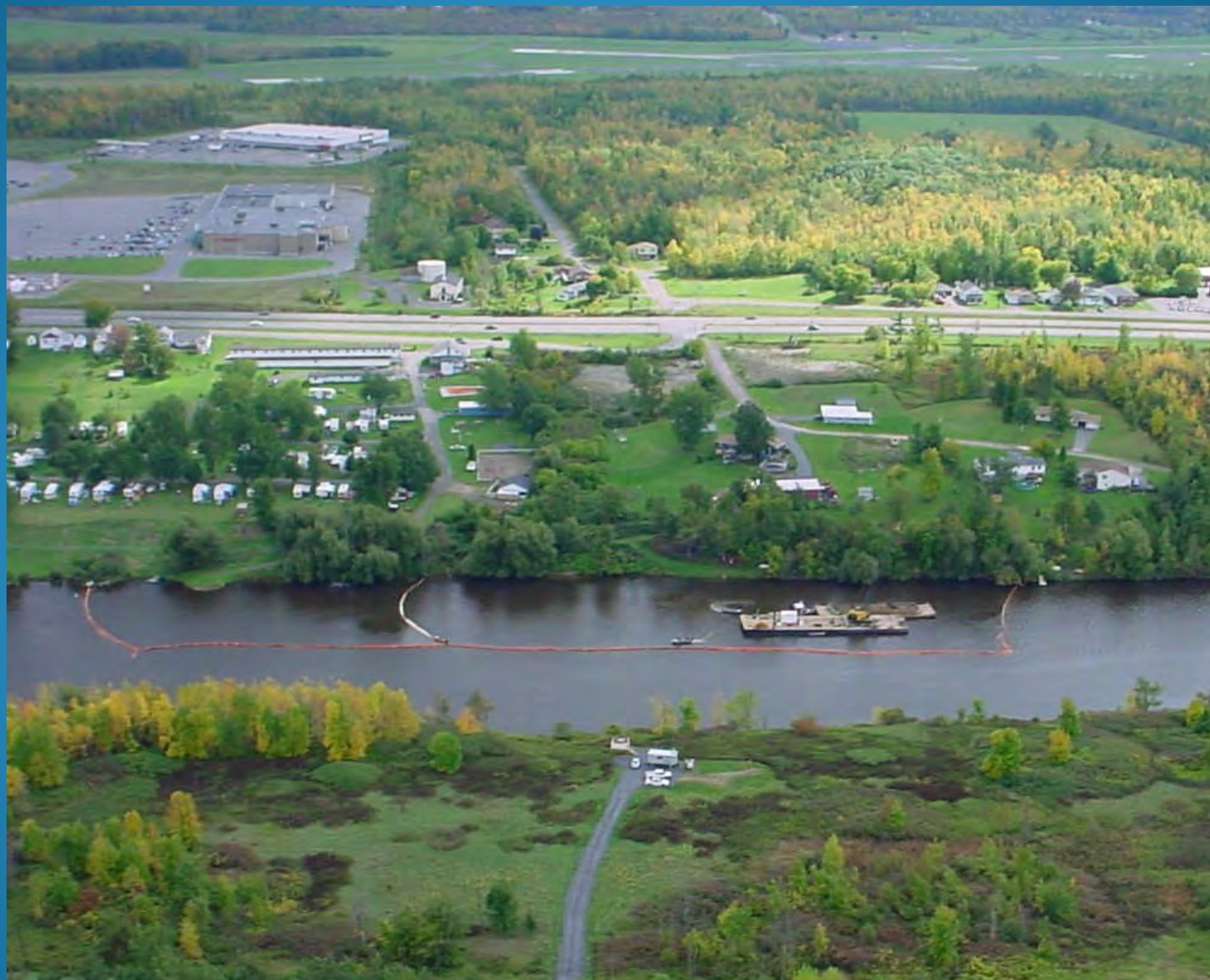
Aerial view of 2001 Capping Pilot Study