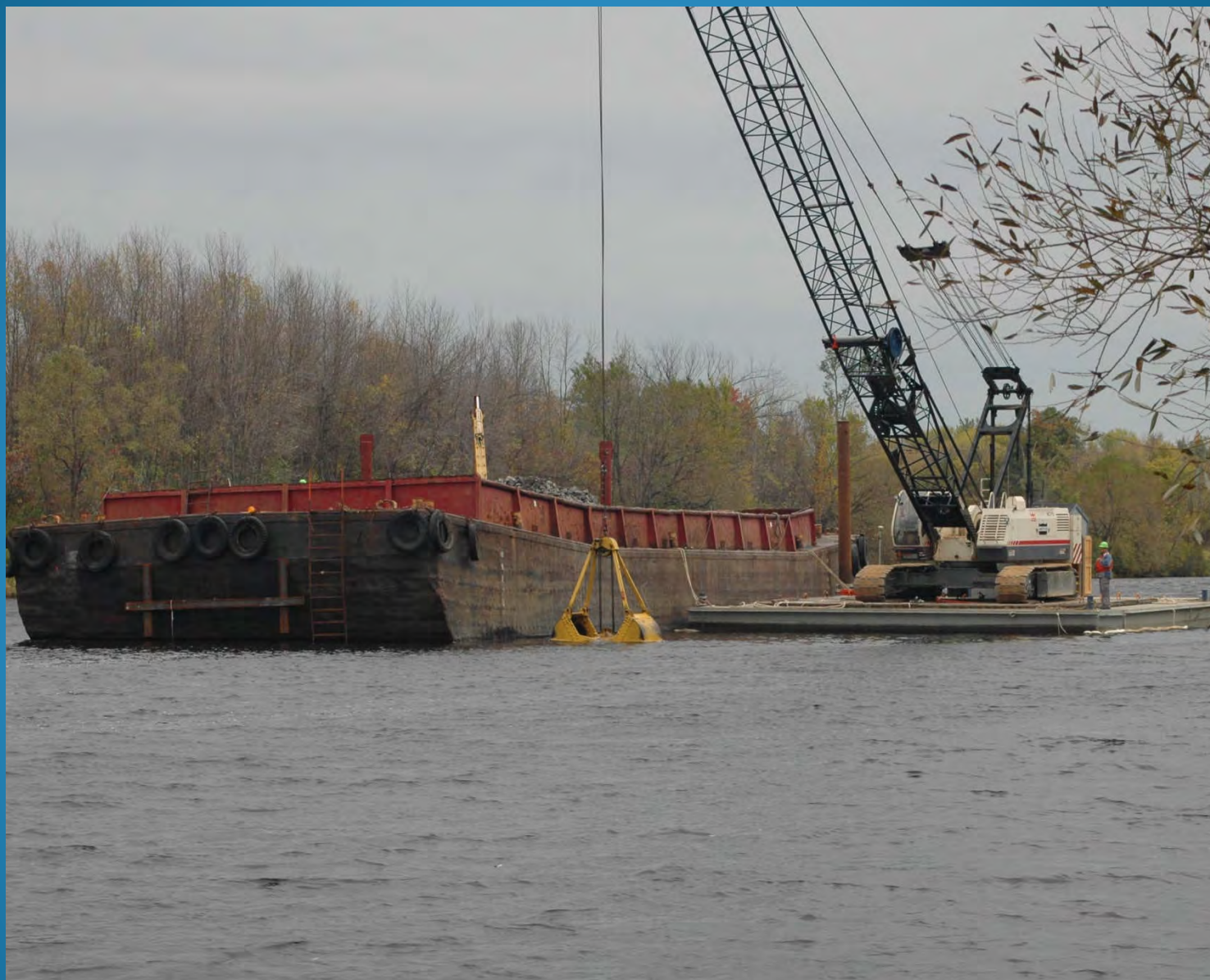
2005 Remedial Options Pilot Study – armor stone placement