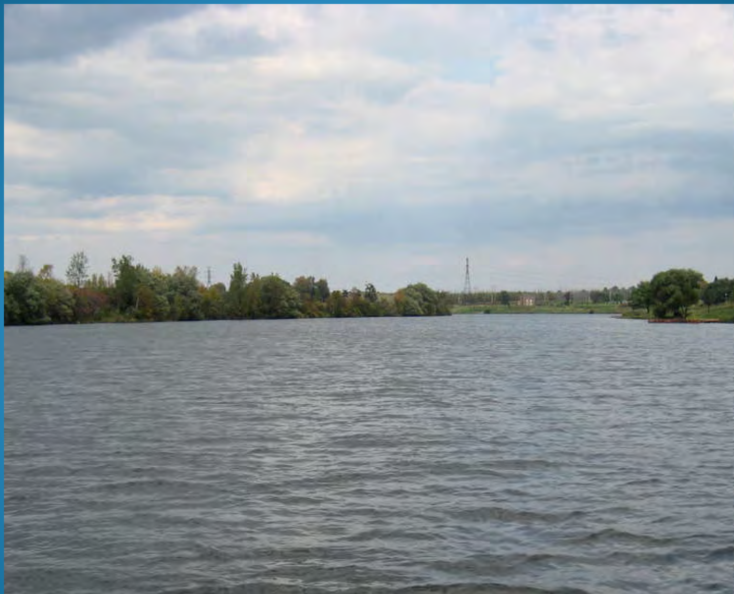
Lower Grasse River – view from boat