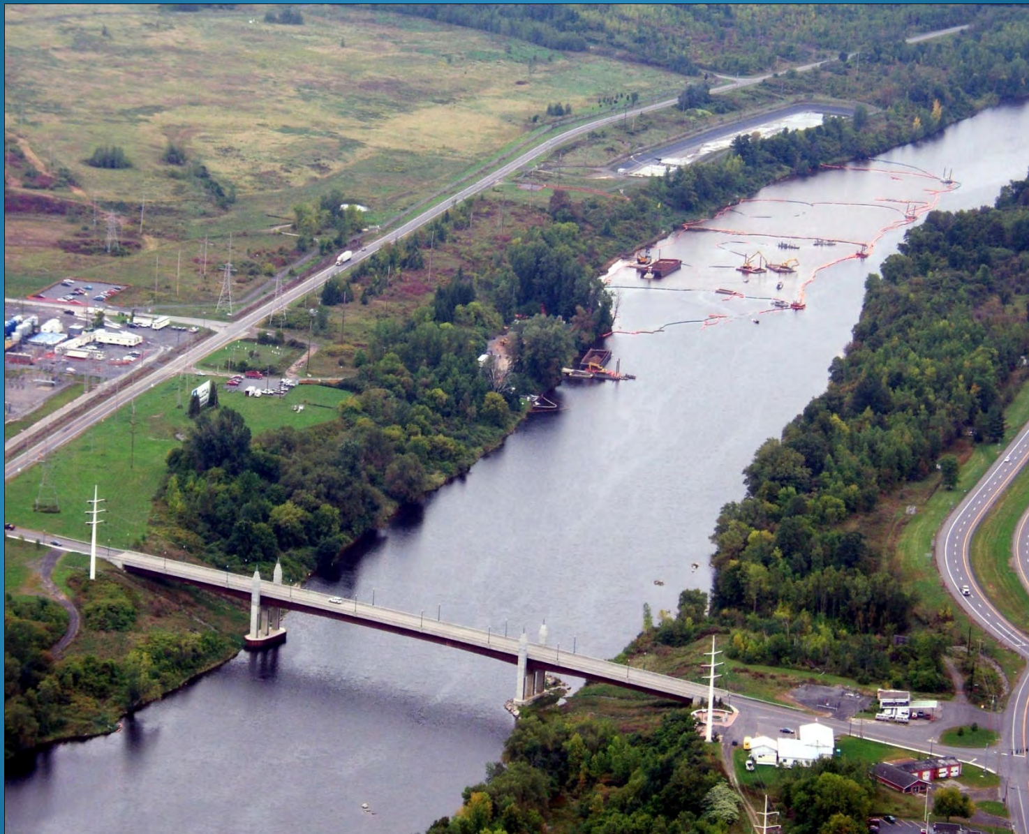
Aerial view of 2005 Remedial Options Pilot Study