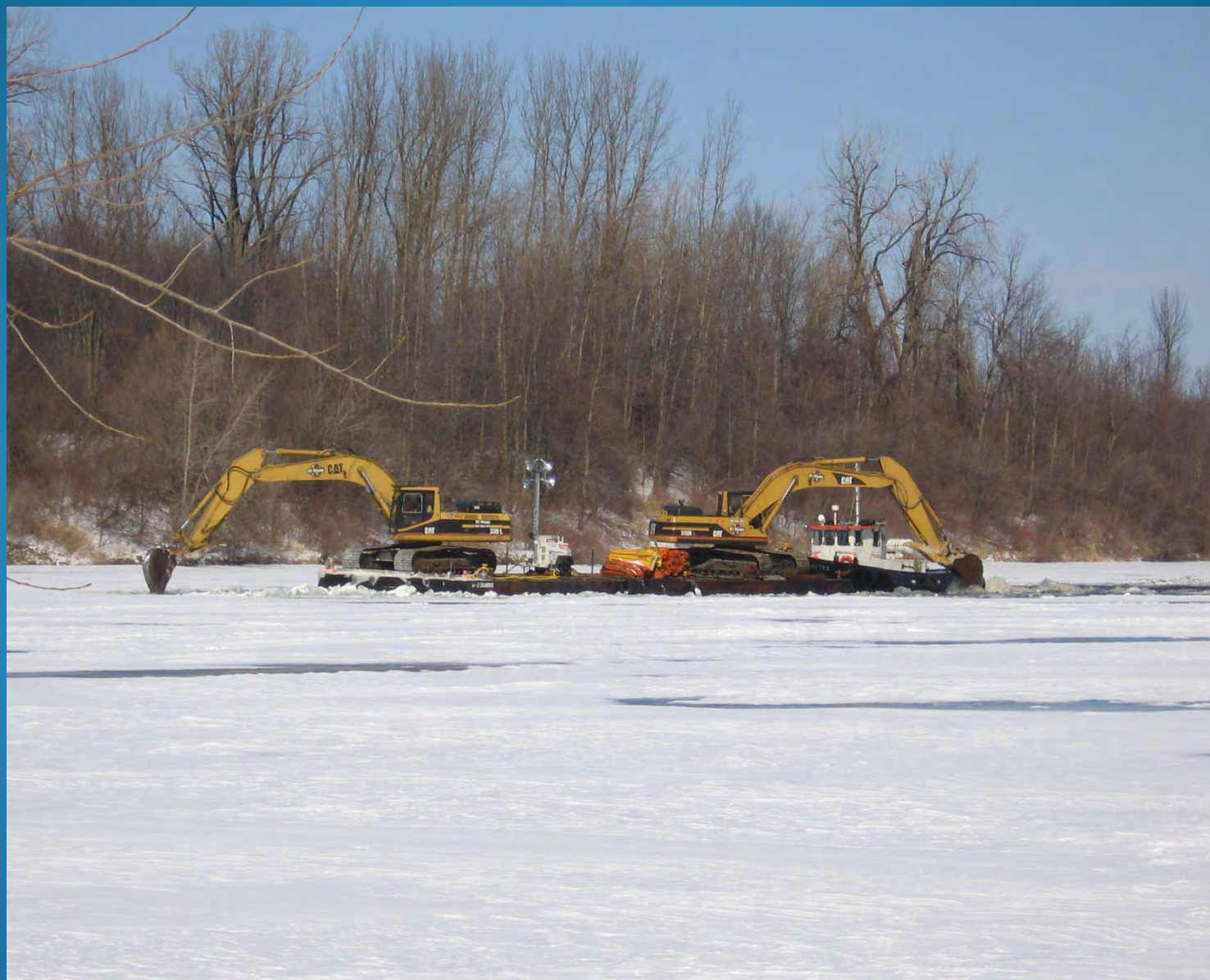
2007 Ice Breaking Demonstration Project – ice breaking efforts