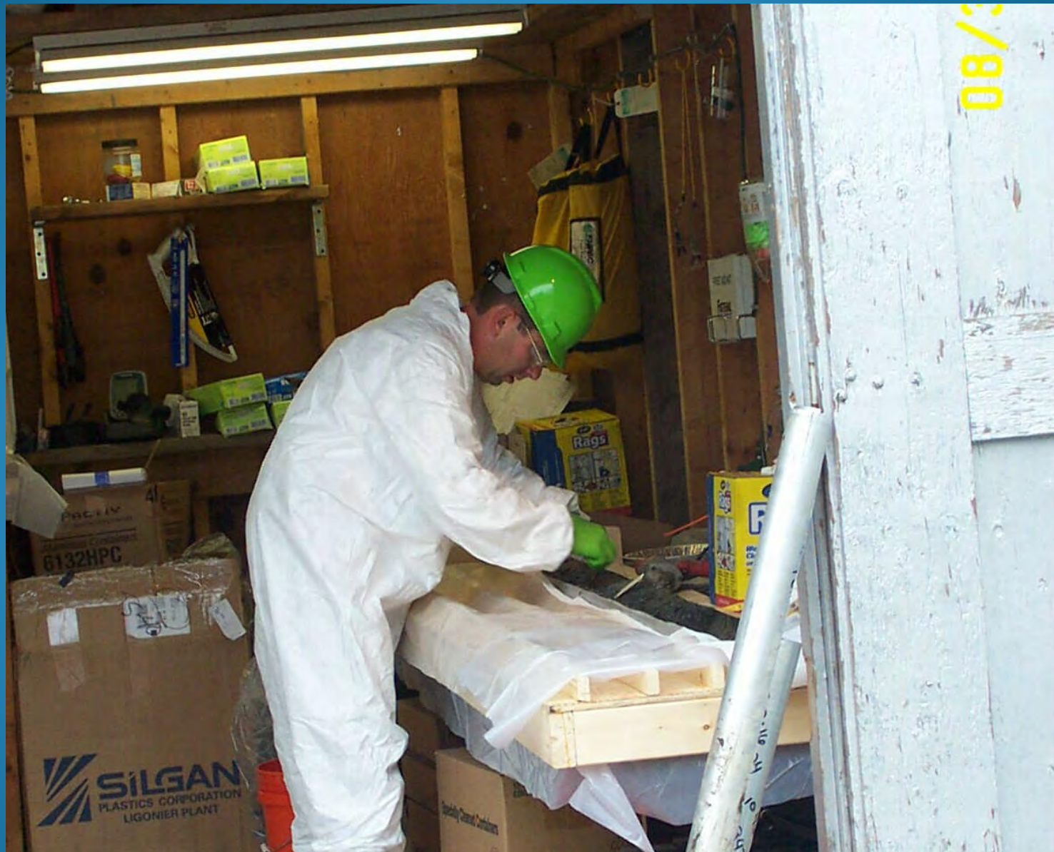
Sediment core processing