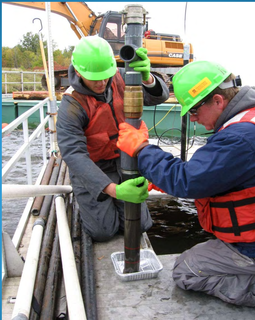
Sediment Core Collection