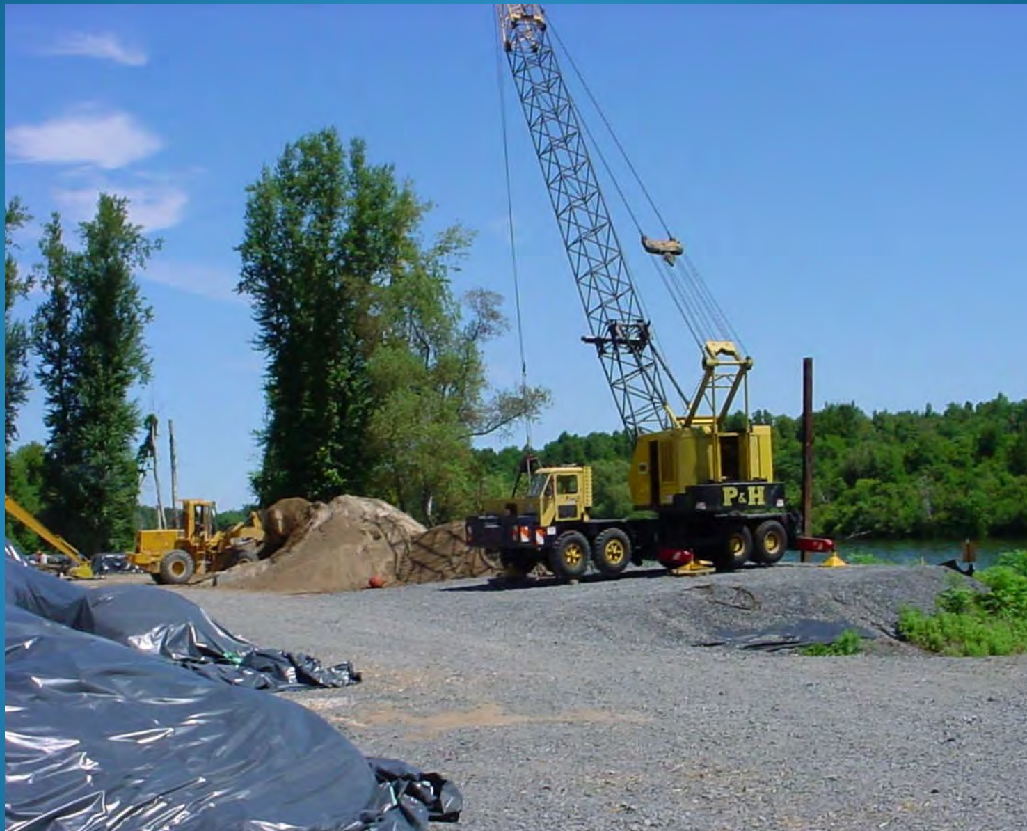
2001 Capping Pilot Study – material staging area