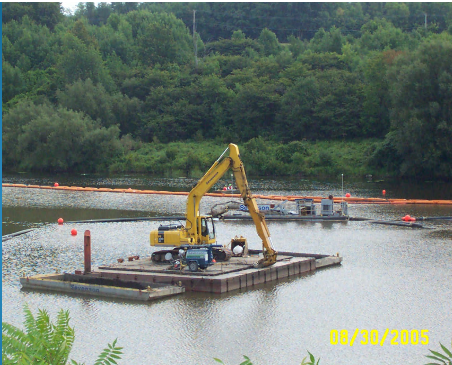
2005 Remedial Options Pilot Study – main channel dredging, debris removal, and water column monitoring