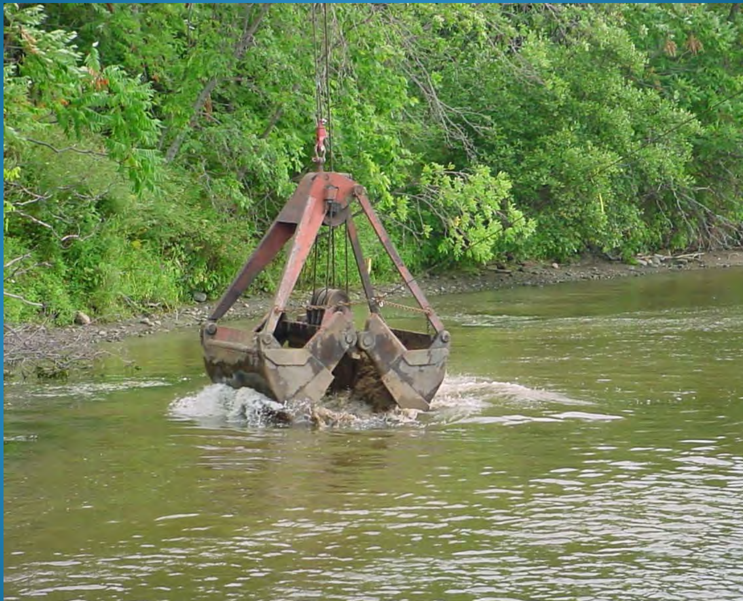
2001 Capping Pilot Study – cap material placement