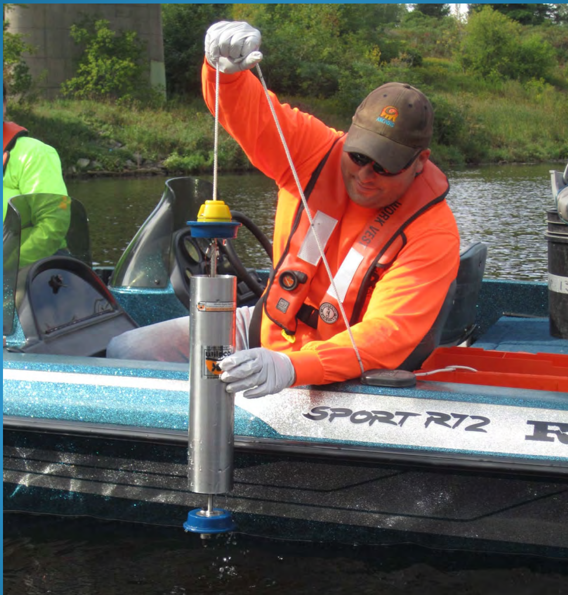
Water column sampling