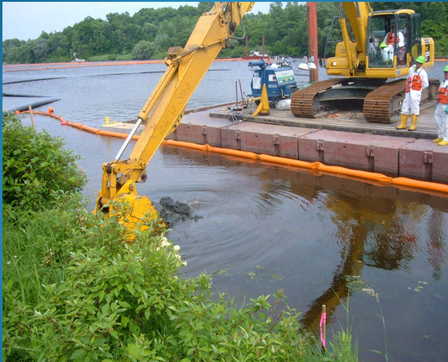
2005 Remedial Options Pilot Study – near shore excavation