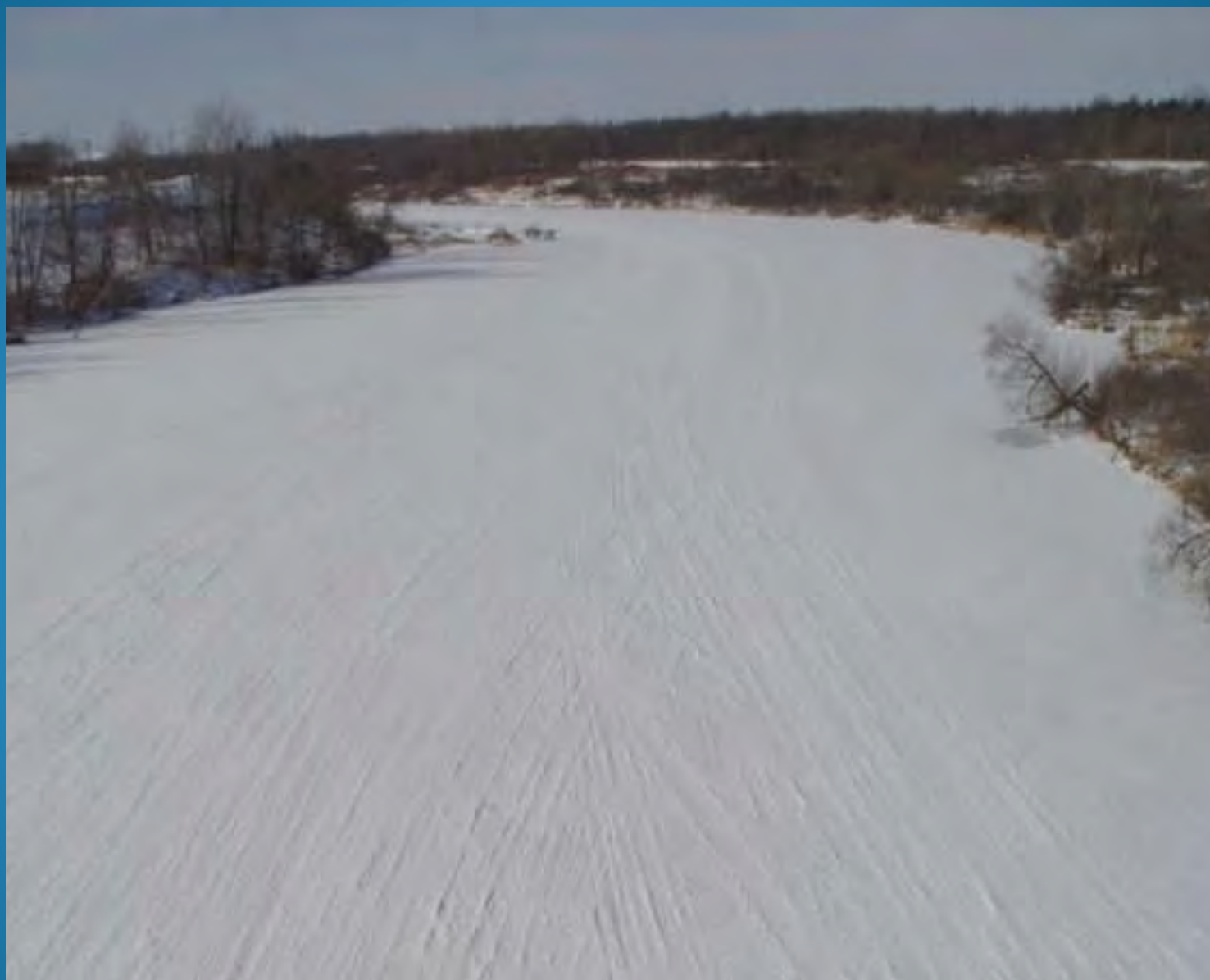
Lower Grasse River – view from bridge