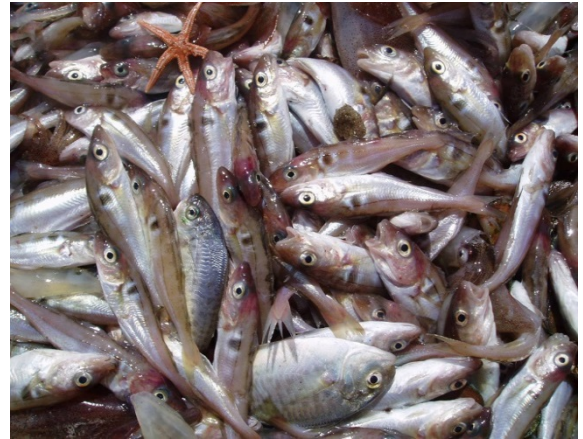
Young-of-the-year haddock

To characterize potential risks that ocean warming may pose to marine fish and invertebrates, the researchers identified factors influencing species resilience. This research could help fisheries scientists' better plan for the effects of ocean warming when developing management measures.