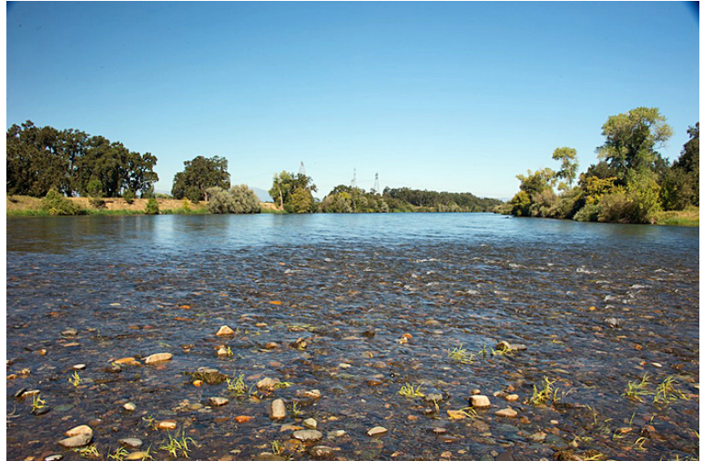
Water flowing over a gravel riffle in the Sacramento River.

Winter-run Chinook salmon are especially challenged when it comes to warmer water temperatures because their eggs are atypically large and require more oxygen exchange. Their egg size evolved to take advantage of cold water above Shasta Dam where they once spawned. However, the salmon now spawn in the warmer Sacramento River below the dam.