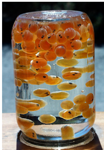
Winter-run Chinook salmon embryos in their egg capsules.

Scientists closely tracking the survival of endangered Sacramento River salmon faced a puzzle: the same high temperatures that salmon eggs survived in the laboratory appeared to kill many of the eggs in the river.