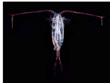
Acartia tonsa .

The University of Connecticut Department of Marine Sciences will investigate the combined effects of warming waters and ocean acidification on a key species of copepod, Acartia tonsa . Copepods, small zooplankton, are the most abundant animals in the ocean and Long Island Sound, and are a primary food source for larger animals such as fish. Source: http://seagrant.uconn.edu/about/research.php .