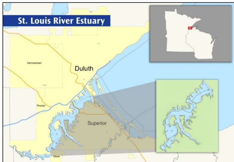
St. Louis River Estuary. (Image courtesy of Wikimedia; I-535_(MN-WI)_map.svg: 25or6to4)

The University of Wisconsin—La Crosse (UWL) is among four colleges that received a $478,000 grant that will shed a light on mercury contamination in a highly industrialized area of the Great Lakes. The two-year grant from The University of Wisconsin Sea Grant Institute will allow UWL and a team of researchers from three other universities, to take a closer look at high levels of mercury contamination in the St. Louis River Estuary. The area runs into the western arm of Lake Superior between Duluth, Minnesota, and Superior, Wisconsin. The grant-funded research aims to understand why fish have high mercury content in this area, as well as to identify where the mercury contamination hot spots are.