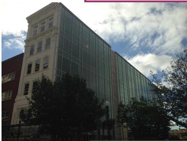
Exterior of the Trifecta Building

"I strongly believe that redevelopment of vacant or underutilized property can not only be a cultural asset for a community but can also change the direction of that community," said Jeff Brown, principal with Charles Street Capital.