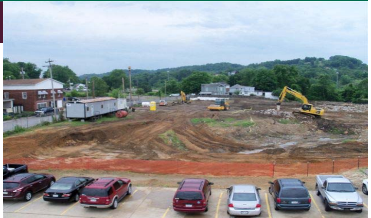
Above: Cleanup and Construction.

Adamston Commons, the shopping plaza, provides retail, commercial, and green space for the local community and spans 5.6 acres. The Commons hosts grocery hotspots, such as Save-A-Lot and Shop-N-Save, a Pizza Hut, and a Dollar Tree for the Adamston community and beyond. The retail outlet provides fresh and affordable groceries, both deli and baked goods, and retail products to the surrounding communities.