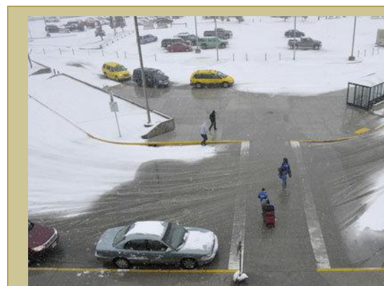
Ground source heat pumps melt snow and ice on sidewalks and runways at the Juneau Airport

Ground source heat pumps (GSHP) operate by using the constant ground temperature as a heat source during the winter when the ground temperature is warmer than ambient air temperatures, and as a heat sink in the summer, when ground temperatures are cooler than ambient temperatures. By pumping a liquid medium through pipes in the ground and then through a compressor and a heat exchanger in the building, GSHP systems use the ground's warmth to heat buildings, but can also act as cooling systems by taking heat from the house and injecting it back into the ground. The installation of such systems can cut residential energy use by as much as 40 percent of total use. Even when ground temperatures are not warm enough to provide all of the heat for the building, ground source heat can raise the room temperature and reduce the base load on supplementary heating systems. GSHP systems require an electrical input to run the pumps that circulate the fluids, so while they provide cheap heat, they do it at an electrical cost. When designed and installed correctly, systems have a payback period of five to ten years and system life for in-home components is 25 years while ground loop life expectancy is over 50 years.