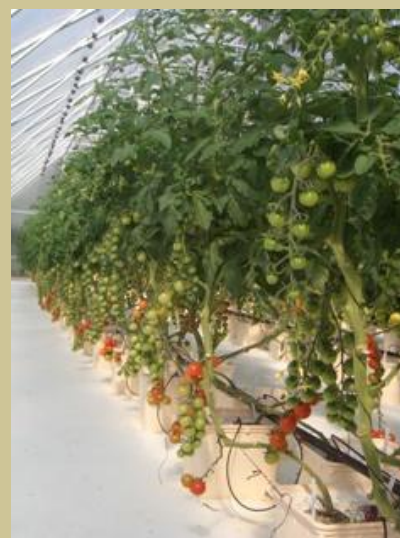
Geothermal generators at Chena Hot Springs

Operationally, electrical generation from high heat geothermal sources works exactly like any other boiler system electrical generation. The ground heat is used to boil water that produces steam to