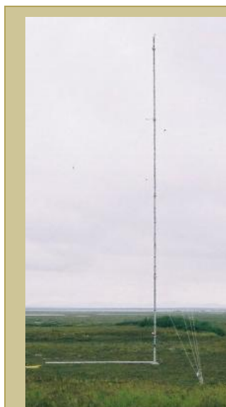
Meteorological tower in Togiak