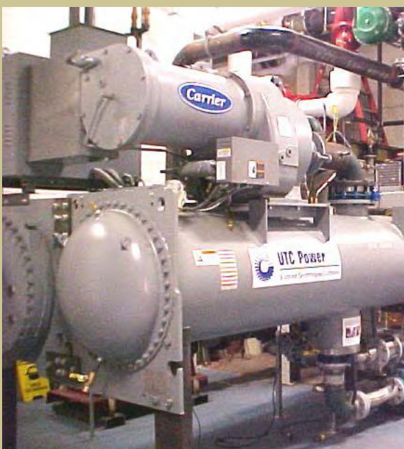
The pump and generator unit for the Chena Hot Springs geothermal power plant