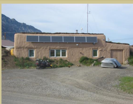
The prototype house in Anaktuvuk Pass built by CCHRC cut heating fuel consumption by 75 to 80 percent.

Fifty-five homes in Quinhagak were found to have mold and mildew severe enough to be declared “disaster” sites and were recommended for reconstruction. In the shorter term, the houses were renovated to make them livable while homeowners wait for new housing, if they choose to build a new home.