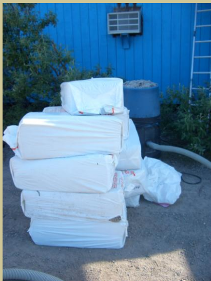
Cellulose insulation added to the village store in Anaktuvuk Pass to improve heating efficiency.