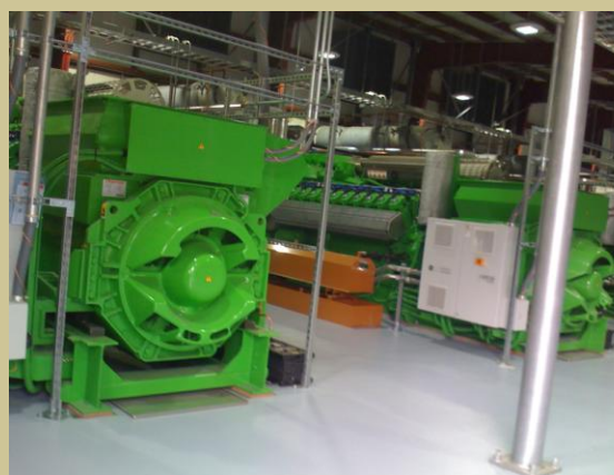
Methane gas generators at the Anchorage Regional Landfill

Another option for getting energy from waste is by capturing the gas that is emitted from landfills and using it as fuel. This method is often employed by large landfills. Currently in Alaska, only Class I landfills (those receiving greater than 20 tons of waste per day) in Anchorage, Kenai Peninsula, and Fairbanks are attempting methane capture projects. The Anchorage regional landfill is developing a 5.6 MW system powered by collected landfill gas. However, this method is nearly impossible for rural communities because of small landfill sizes.