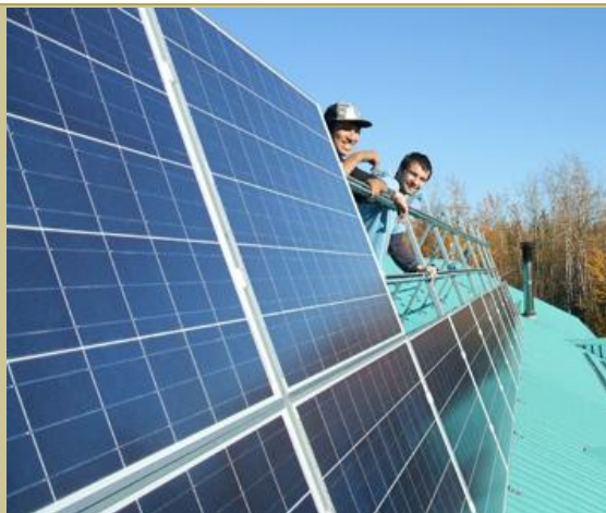
Photovoltaic panels on top of the Nenana teen recreational center

Photovoltaic (PV) arrays, or sets of PV panels installed together, are possibly the most recognizable of the solar energy collection systems and work by converting light energy directly into electrical energy within each “cell”, the smallest unit of a PV light collecting system measuring 10 cm to 15 cm square. The technology behind the functioning of PV systems is relatively complex and constantly improving. Within each cell, sunlight striking the PV material, usually silicone, creates an electrical current that can then be used directly for an energy source. PV modules, a unit composed of multiple PV cells, have no moving parts therefore suffer little wear and tear thus making operation and maintenance very low cost and providing life expectancies of 20 years or more. Power inverters, mechanisms that convert electricity from the panels into usable electricity in the home, are typically the only pieces of equipment that need replacing over the life of the PV system.