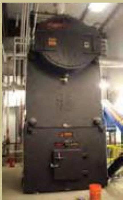
Wood chip burner in Tok

Despite the low cost of the fuel resource, chip fired boiler systems tend to be large, best suited for large buildings or district heating. They require constant operational maintenance and more complex facilitates to accommodate an effective system, including an automatic chip feeding system.