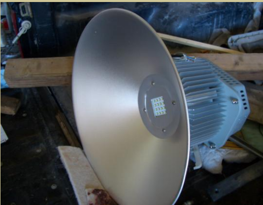
Large scale lighting fixtures installed in the automotive garage in Anaktuvuk Pass cut energy consumption in that building by 60 percent.

RurAL CAP's Energy Wise program functions alongside to its weatherization program. Services provided by the weatherization plan involve more labor intensive projects such as added insulation and installing higher efficiency windows and doors. In 2011, RurAL CAP, through its weatherization program, weatherized 810 homes (228 in 10 rural communities and 496 in Anchorage and 86 in Juneau) and hired and trained 263 local residents to do those projects in the process. Currently RurAL CAP is in the process of fully weatherizing 15 homes in Kotzebue. Also, the U.S. Department of Energy offers weatherization services similar to those of RurAL CAP for little to no cost.