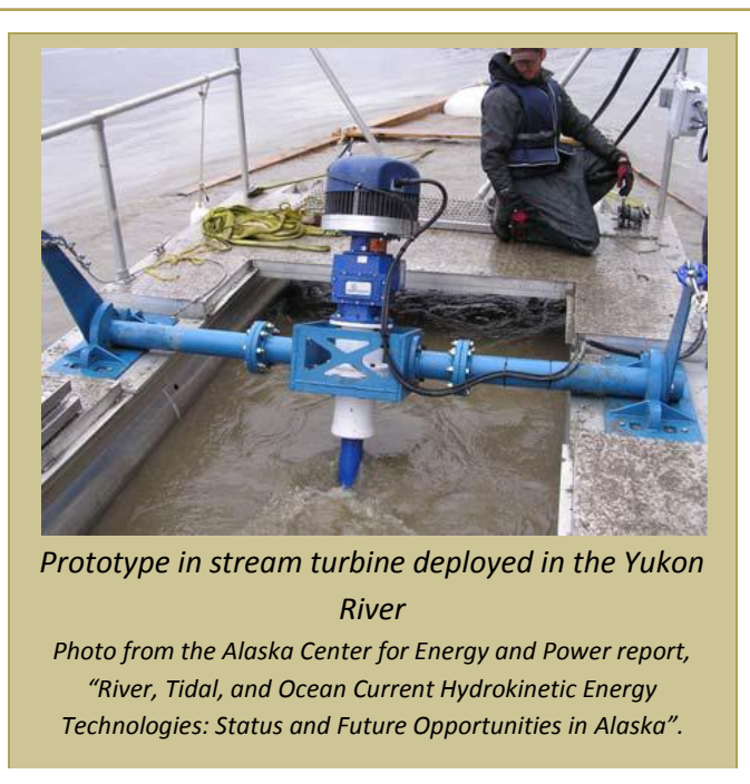
Prototype in stream turbine deployed in the Yukon River

Different from in-stream turbines, run-of-the-river diverted water stream turbines have been employed for many years. They function by using the natural flow of a river or stream through a constructed channel to turn a turbine and produce electricity. Diverted water hydro systems are larger than in-stream systems requiring more infrastructure, which makes them more costly than in-stream turbines, but without requiring large dams as with traditional hydroelectric. The Gustavus Electric Company installed a diverted hydro system in 2006 for $10 million that provides the majority of their electrical needs and displaces approximately 126,000 gallons of fuel.