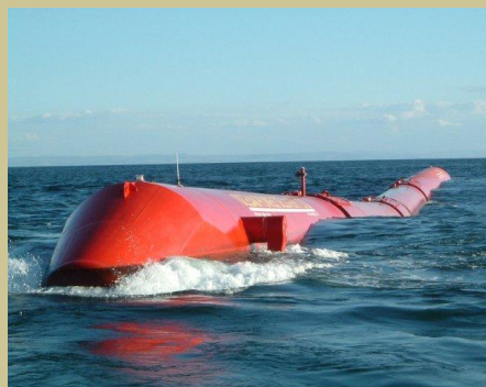
Pelamis wave energy buoy off of Hawaii