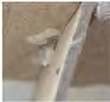
Close up of eggs on cardboard (H. Harlan)