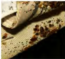
Canvas strap of old box spring covering that is housing adults, skin castings, feces, and eggs.

If the room is heavily infested, you may find bed bugs in the seams of chairs and couches, between cushions, in the folds of curtains, in drawer joints, in electrical receptacles and appliances, under loose wall paper and wall hangings -- even in the head of a screw. Since bed bugs are only about the width of a credit card, they can squeeze into really small hiding spots. If a crack will hold a credit card, it could hide a bed bug.