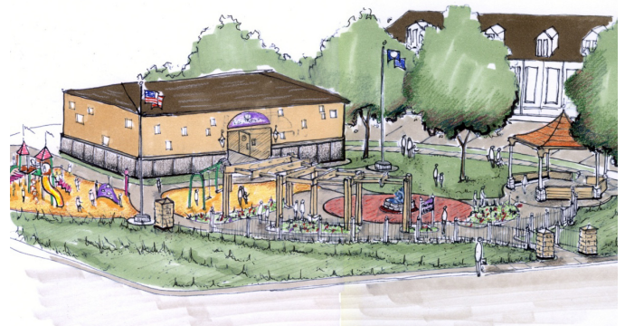
An architectural rendering from the "Vision-to-Action" session.

KENTUCKY – The Kentucky Brownfields Redevelopment Program utilized Section 128(a) Response Program funding to facilitate free visioning sessions for towns that received, or are interested in applying for, EPA Brownfields grants. This unique opportunity is based on the "Vision-to-Action" approach developed by the U.S. Army Corps of Engineers. The model allows for the attendees to sketch their individual visions for the future of their neighborhoods. Stock sketches of community activities, people and places including park scenes, farmers' markets and other outdoor activities are presented, which then allows participants to attach their own visions to posters, surrounding their pictures with small vignettes of other related, sketched visions. A landscape architect participates in these sessions to create a preliminary sketch for the community to approve using the visions.