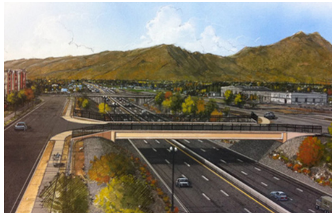
Artist rendering of the southern end of the completed redevelopment project.

UTAH – In Murray, a new $80 million transit oriented development gave new use to 20 acres of former industrial property. The former Simpson Steel property was assessed and cleaned up under the Utah Department of Environmental Quality's Voluntary Cleanup Program, a Section 128(a) Response Program funding grantee. In 2008, property sampling identified several areas of metals and petroleum impacted soils, as well as slag material and sediments in Big Cottonwood Creek, which also contained elevated metals. In 2009, the property owner removed all impacted materials that exceeded site-specific cleanup levels. The redevelopment project was initiated in 2011 with the construction of a new overpass for site access and 400 apartments within 15 buildings. This first phase is expected to be completed in spring 2012 and will be followed by the construction of 268 low-income units as well as retail, restaurant and office space—all of which will be less than a five minute walk to a light rail station.