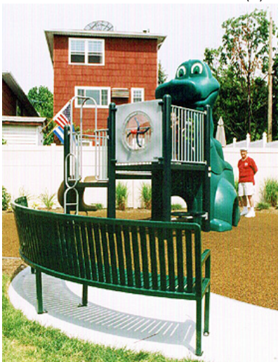
The new park in the Elm Street neighborhood of Kearny, NJ.

NEW JERSEY – In the Town of Kearny, a new park in the Elm Street neighborhood serves as an asset to its community as a result of the assessment and cleanup of an abandoned tool and dye shop. The New Jersey Department of Environmental Protection used Section 128(a) Response Program funding to oversee the assessment and cleanup of the property. The transformation of this property was completed through an open process that engaged various stakeholders and required teamwork to address technical issues and to obtain resources to see this project to a successful completion.