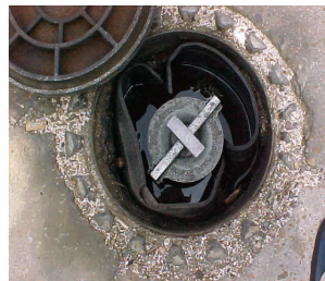
Deformed spill bucket wall

Damaged, cracked, or corroded spill buckets are not liquid-tight and will not contain the spilled product.