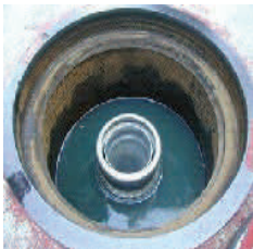
Liquid in spill bucket

Spill buckets are designed to temporarily contain small product spills released during delivery and are not for long-term storage of product. Accumulated debris or liquid reduces containment capacity and ability to prevent spills.