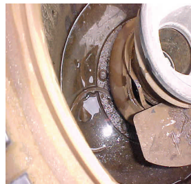
Damaged seal in poor condition

Damaged seals and gaskets can result in non-tight spill buckets. This can allow a release into the environment.