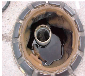
Damaged spill bucket

Perform an integrity test and, if necessary, repair or replace to make sure it works properly.