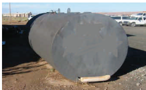
Steel tank with sacrificial anode

Keep records of system installation, triennial testing, integrity assessments, and repairs to help determine whether your system is in compliance with the corrosion protection requirements.