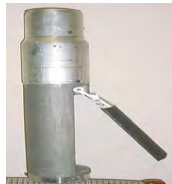
Automatic shutoff device (flapper valve)