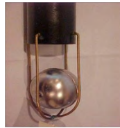
Flow restrictor (ball float valve)

If a tank is overfilled, product could be forced through the vent line and other loose tank fittings, potentially resulting in a damaging and costly release into the environment. Properly functioning overfill prevention will significantly reduce the chance of an overfill release.