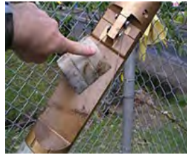
Automatic shutoff device with damaged float