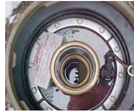
Looking down the fill pipe at the flapper valve

The automatic shutoff device is located in the drop tube within the fill pipe riser.