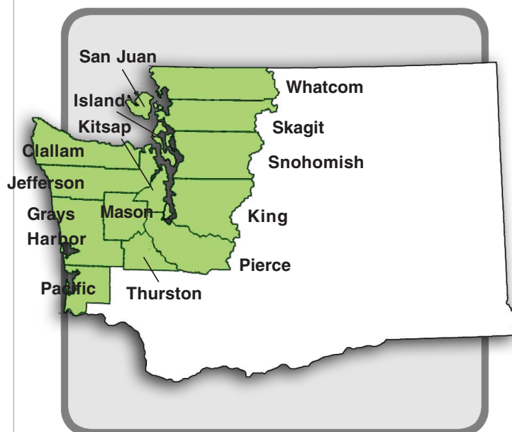
Table 1. Breakdown of monitored and unmonitored coastal beaches by county for 2007.