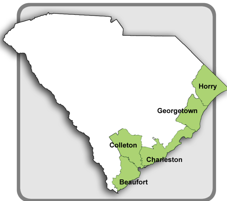
Table 1. Breakdown of monitored and unmonitored coastal beaches by county for 2010.