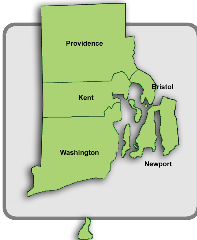
Table 1. Breakdown of monitored and unmonitored coastal beaches by county for 2010.