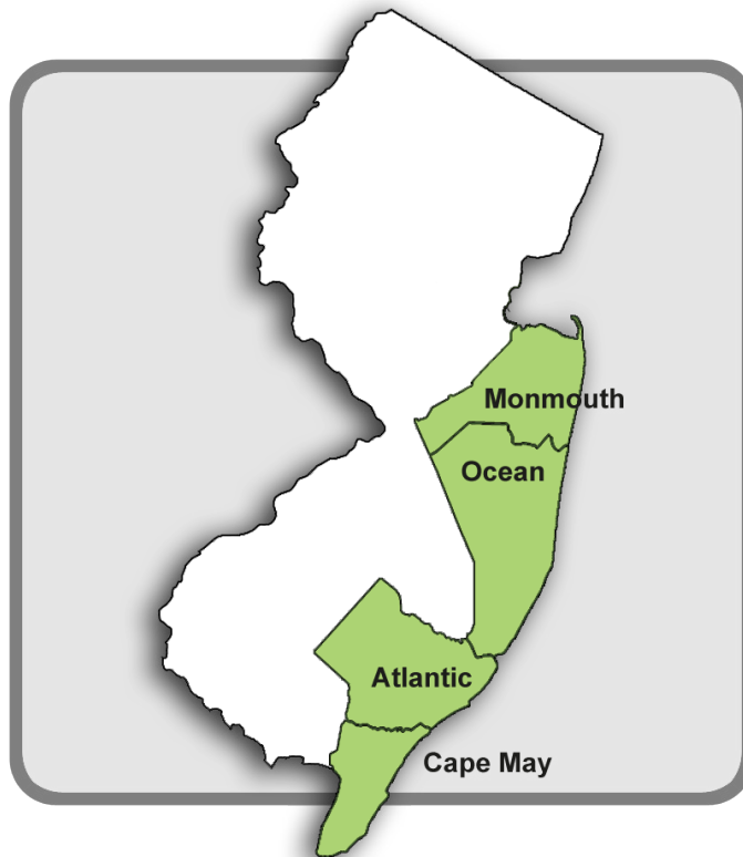
Table 1. Breakdown of monitored and unmonitored coastal beaches by county for 2010.