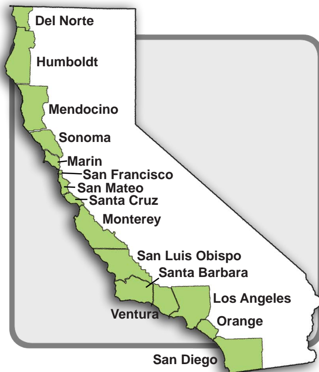
Table 1. Breakdown of monitored and unmonitored coastal beaches by county for 2007.