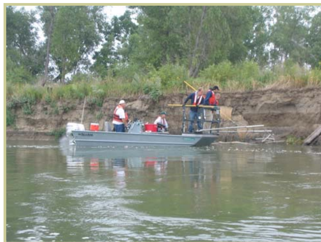
Texas Fish crew sampling the Upper Missouri River

but are not normally found in Texas like the walleye, northern pike, and sturgeon. However, they had their fill of gizzard shad (too many to count) by the end of the sampling season. They gave a "thumbs up" to North Dakota scenery and the pristine conditions found in many places in the Garrison Reach. Would they like to come back and work on the Upper Missouri River? Most definitely!