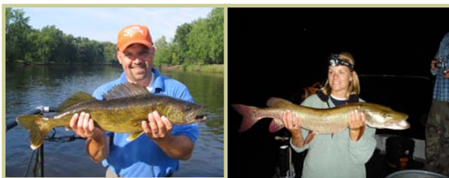
A map of the large river basins in the Region V REMAP project and some trophy fish collected in 2004.