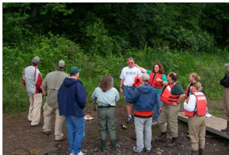
Riparian training session from 2004 field season.

A special issue of Environmental Monitoring and Assessment Vol 103, No. 1-3, April, 2005 highlights the EPA EMAP Symposium held in Kansas City, MO in 2002. Several papers from members of the EMAP-GRE team were included in this publication