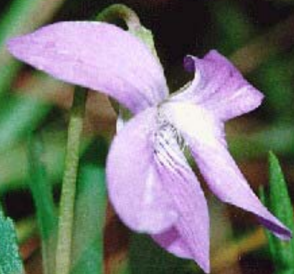
Prairie Violet ( Viola pedata )