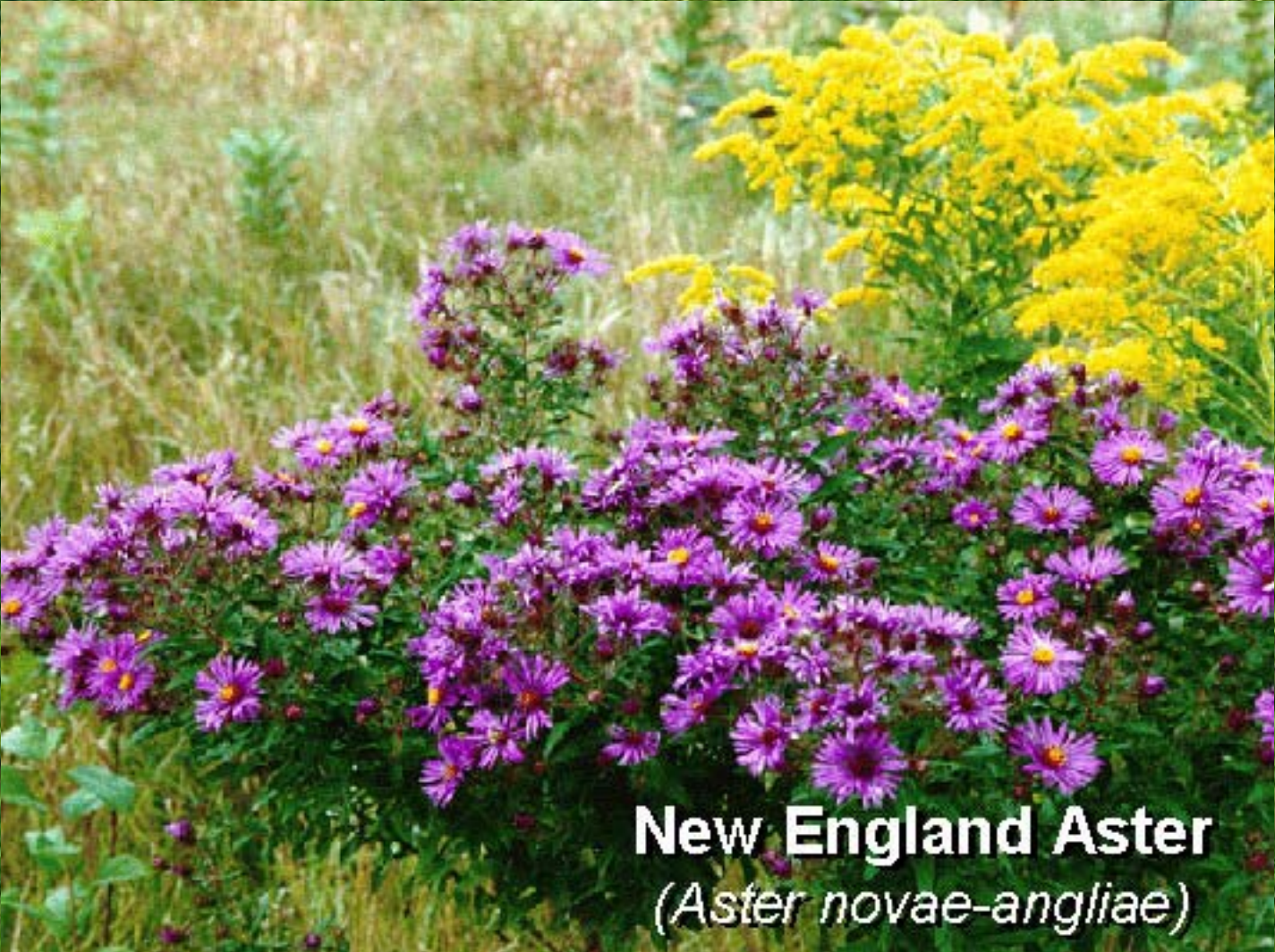
New England Aster (Aster novae-angliae)