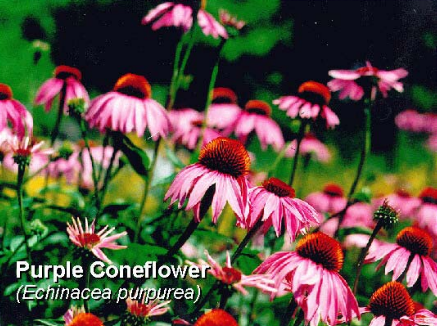
Purple Coneflower ( Echinacea purpurea )