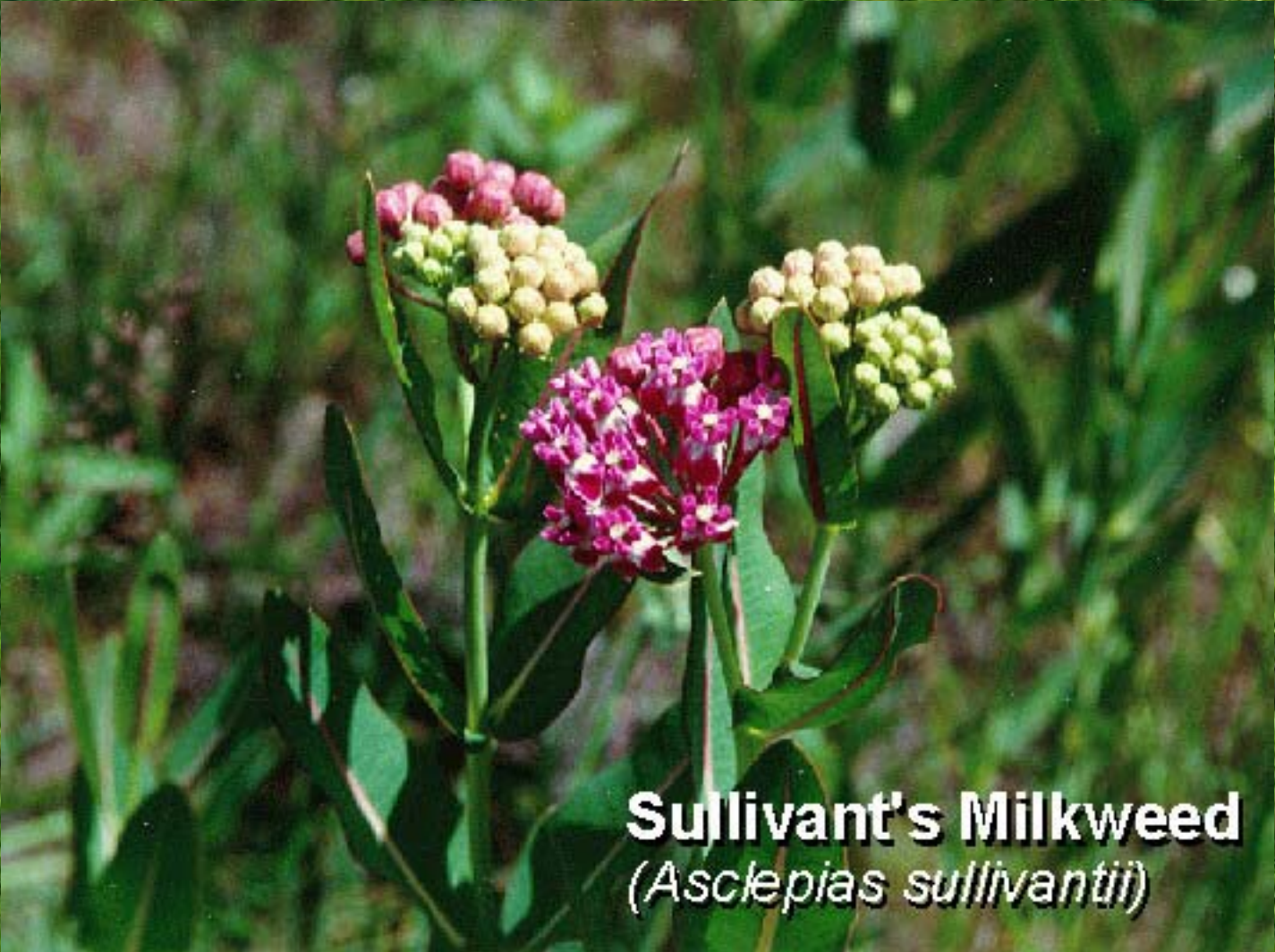
Sullivant's Milkweed ( Asclepias sullivantii )