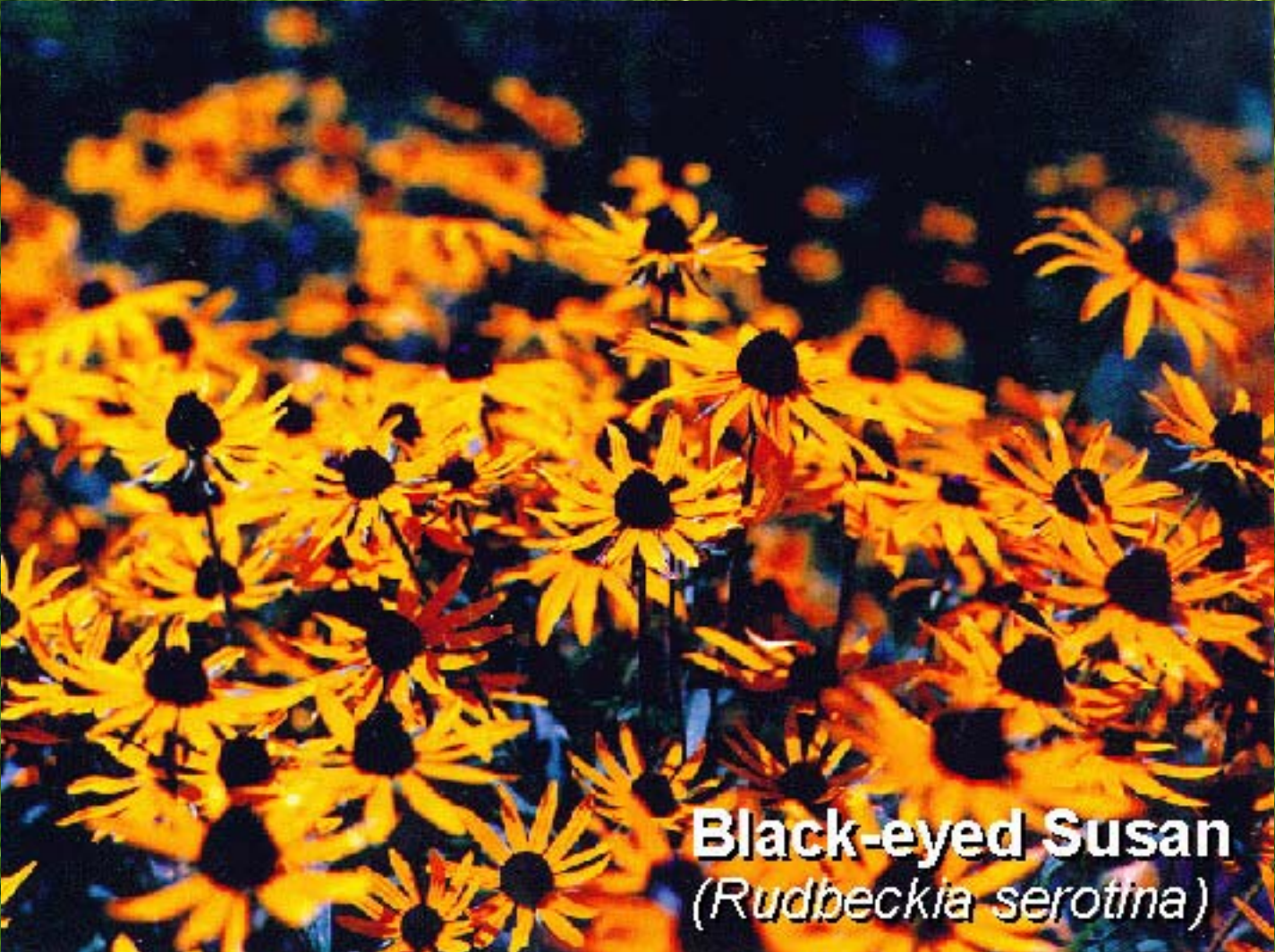
Black-eyed Susan (Rudbeckia serotina)