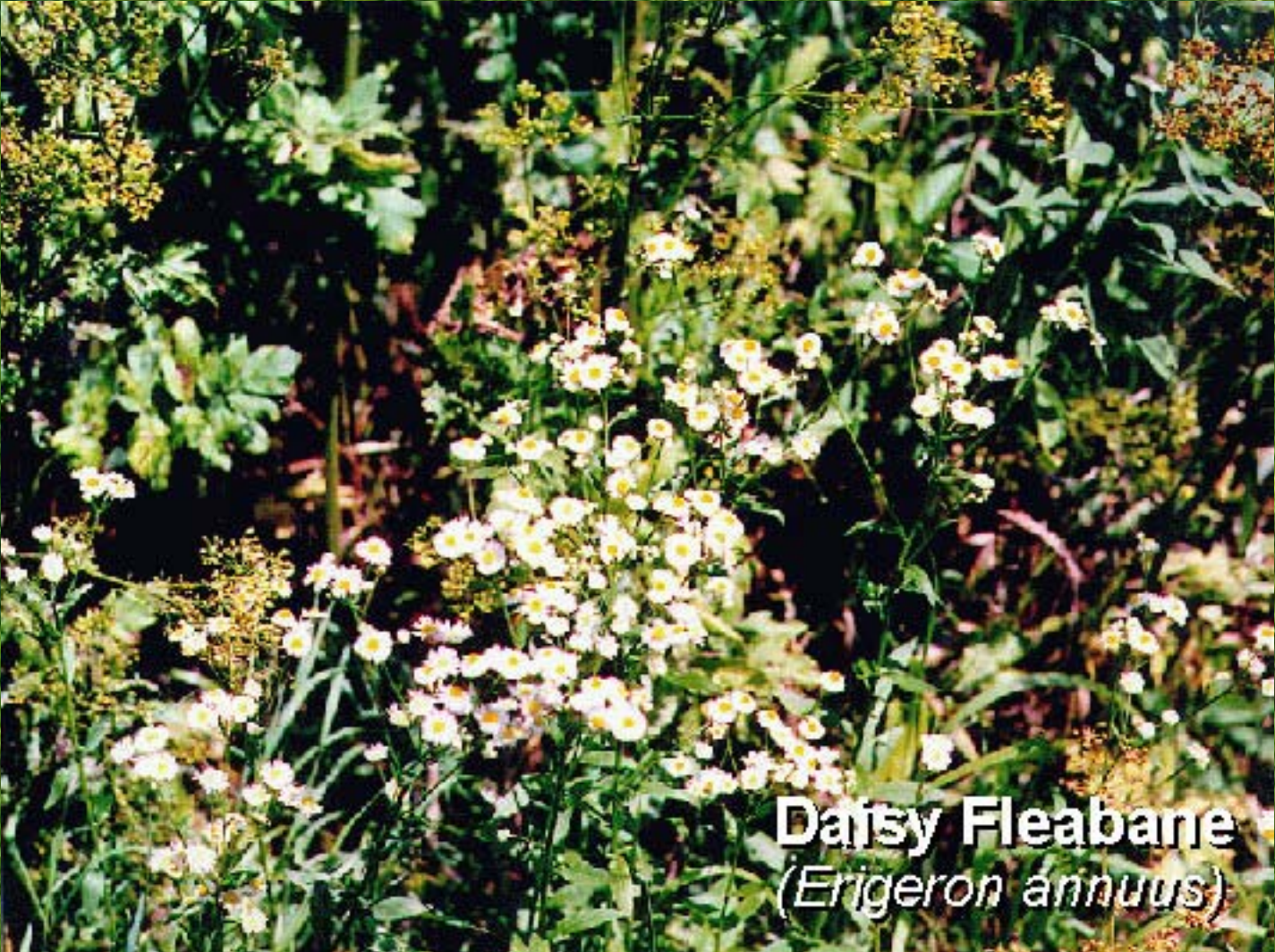
Daisy Fleabane ( Erigeron annuus )