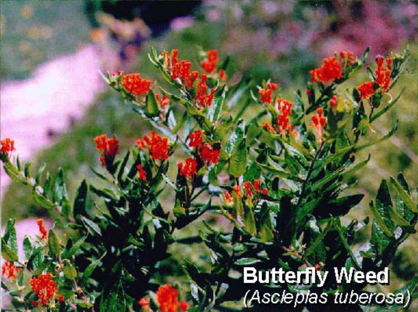
Butterfly Weed (Asclepias tuberosa)