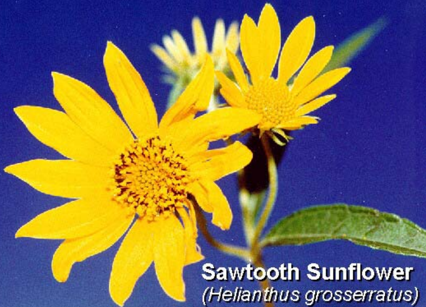
Sawtooth Sunflower ( Helianthus grosserratus )