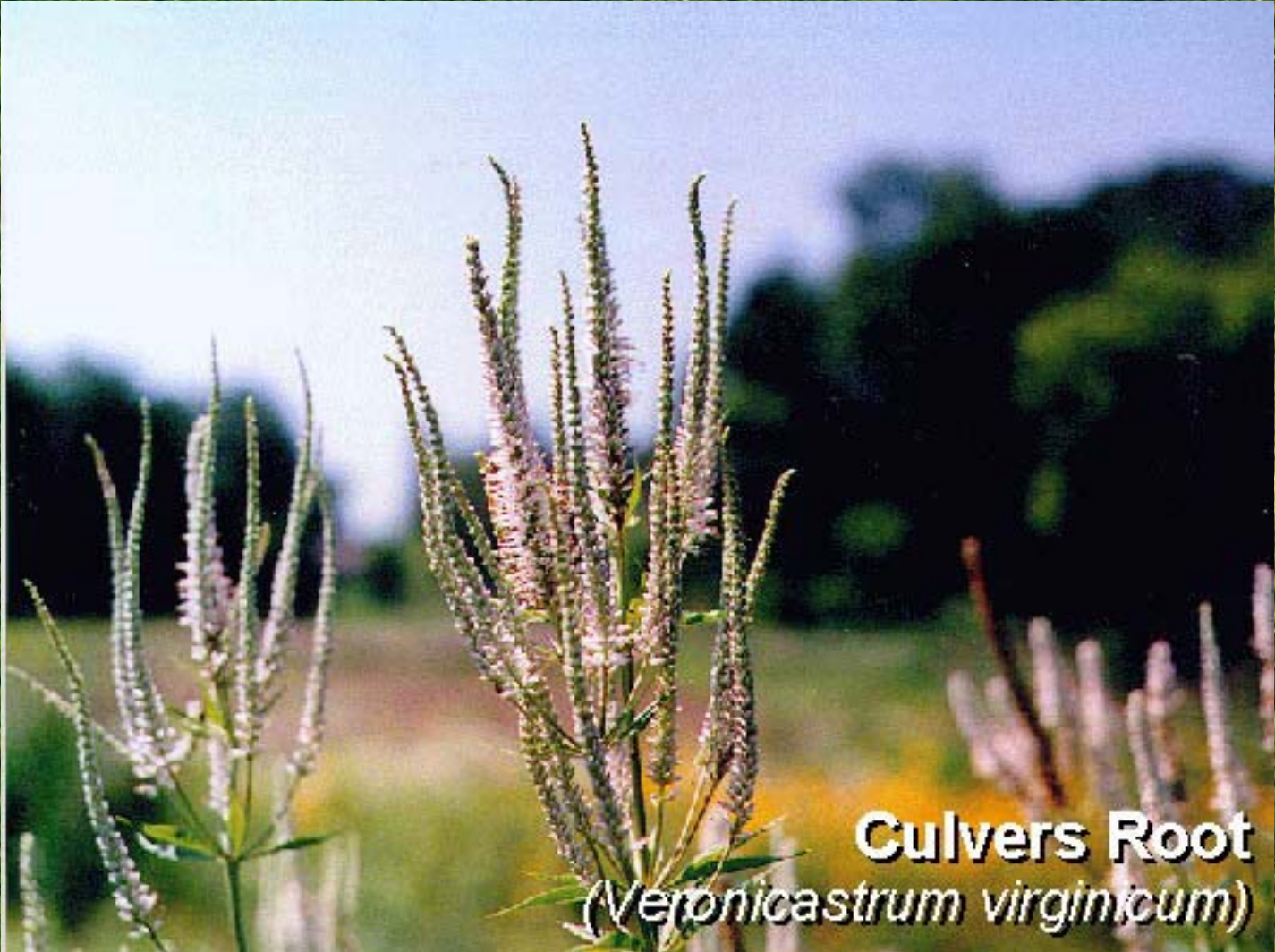
Culvers Root ( Veronicastrum virginicum )