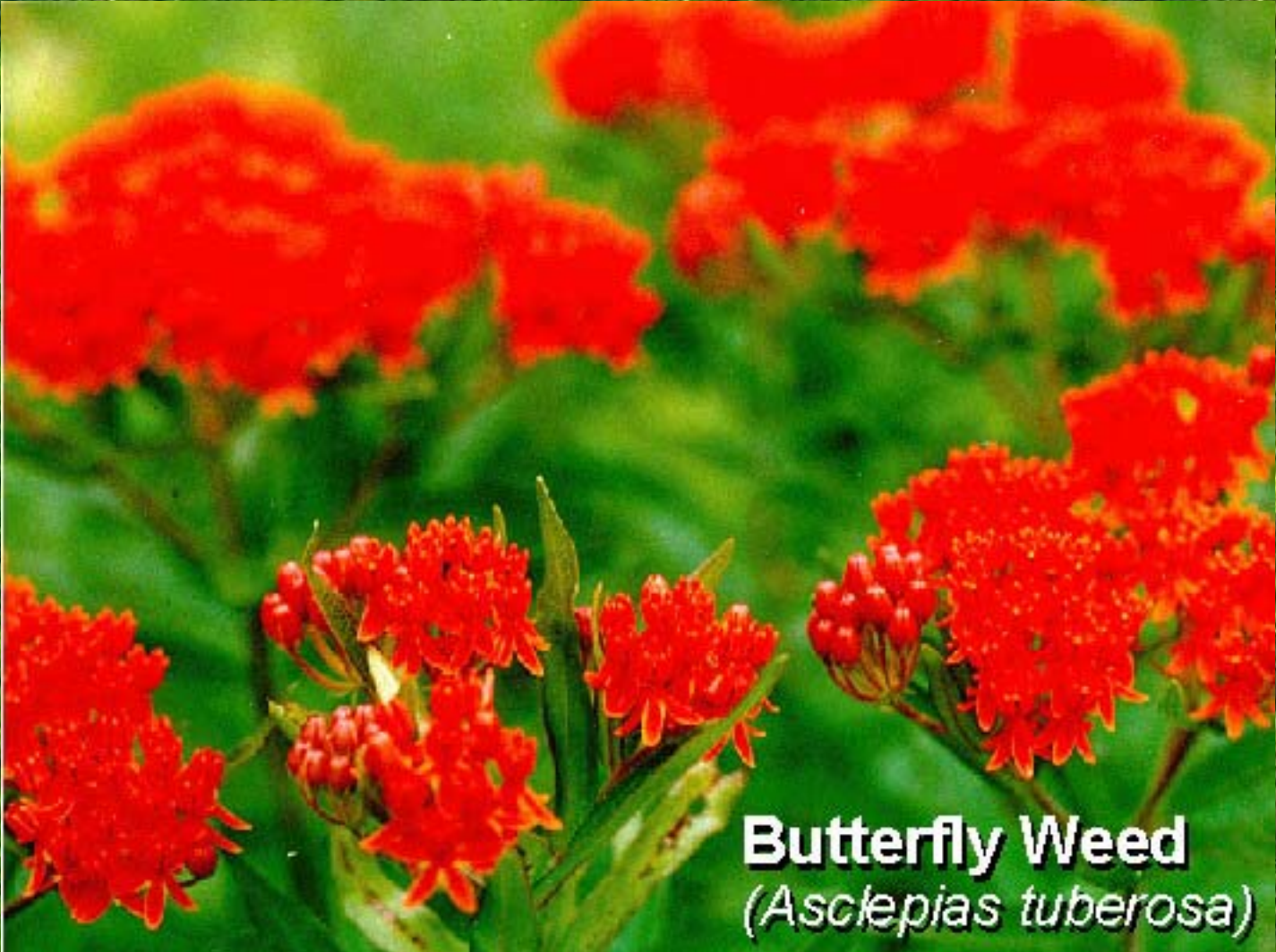
Butterfly Weed ( Asclepias tuberosa )