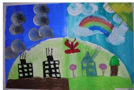
This artwork by an elementary school student at Henry Lomb School of Rochester City School District won a CARE-sponsored design competition to create educational messages about air pollution and will be displayed on retrofitted diesel refrigeration trucks.

Awarded at two monetary levels, over two years, CARE grants help communities tackle their problems using a four-step process (diagram below). Level I grants (up to $100,000) enable communities to progress through the first two steps, which are: 1) build a broad-based partnership, and 2) identify a range of environmental problems and solutions. Level II grants (up to $300,000) fund the next two steps, which are: 3) take action to reduce risks; and 4) become self-sustaining.