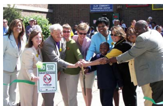
Partners join together for a ribbon-cutting ceremony at Clay Elementary School, opening the first "No Idling Zone" at a public school in St. Louis.

Please visit the CARE Web site at <a href="https://www.epa.gov/CARE">www.epa.gov/CARE</a> for more information.