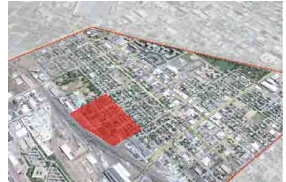
Aerial map of La Alma / Lincoln Park neighborhood

La Alma Lincoln Park Neighborhood Association (LPNA f.k.a. LLPPG) – Many of the transportation programs and infrastructure developments included in this report will not be successful without engaging and developing support within the LALP resident community.