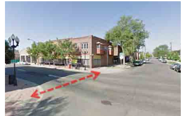
Desired pedestrian crossing at 10 th Ave. and Santa Fe St.