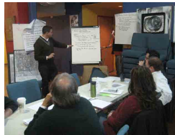
Charrette working group presentation