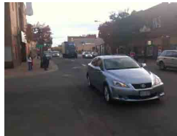
Intersection at 10 th Ave. and Santa Fe St.

Identify priority strategies for creating safe and accessible walking, biking, driving, and public transportation options for South Lincoln residents and develop an implementation plan to overcome the anticipated barriers to each of those strategies.