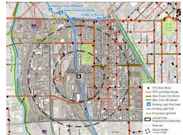
Aerial transit map for La Alma / Lincoln Park neighborhood