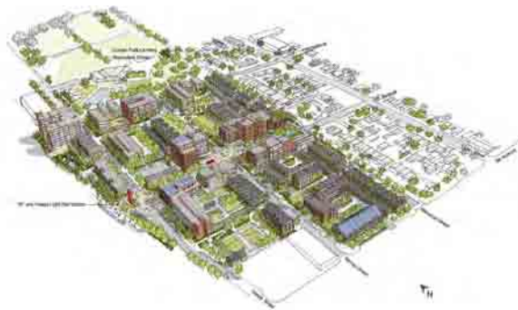
South Lincoln Redevelopment Master Plan rendering