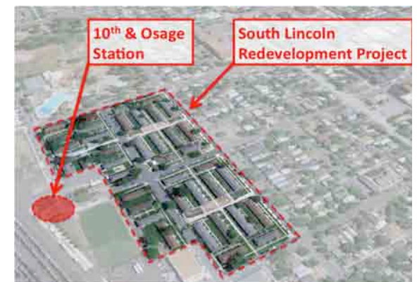
SoLi transit-oriented development map