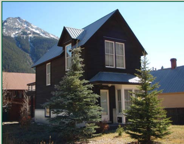
A typical home in Silverton, Colorado.

The county originally counted on funding from the State of Colorado to cover two thirds of project costs. That funding was no longer available after the state suffered from the national financial crisis. The project faces a funding shortage of between $326,000 and $764,000. EPA assisted in identifying grants and other potential funding sources to help diversify the pool of funding sources.