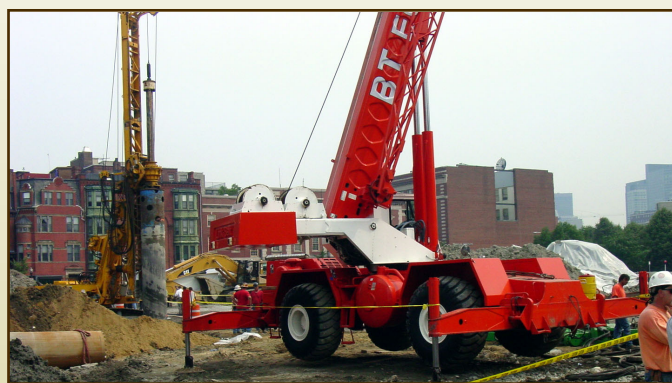
Brownfields cleanup in Boston, Massachusetts.

Additional Davis-Bacon Wage Determination Reference Material http://www.access.gpo.gov/davisbacon/referencemat.html