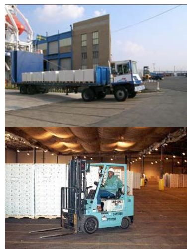
Cleaner-burning Equipment used

Clean Air Council (CAC) of Southeast Philadelphia, PA is engaged in building trust and capturing the attention of local port officials, businesses, unions and civic groups. The CAC learned that several port operators switched their equipment from diesel-fueled to relatively cleaner propane or electric power due to increased concern for employee health and safety and greater efficiency. These employee-centered concerns open the door for unions to play an important role in expanding CAC’s actions. In addition, several groups, including the Coast Guard’s Ecological Risk Assessment, an Environmental Justice Regional Citizen’s Committee, the Delaware Valley Goods Movement Task Force, and Philadelphia Diesel Difference Working Group, joined a multi-media Port Task Force to create a comprehensive approach in expanding the port area.