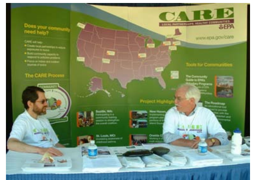
CARE staff members at outreach booth National Sustainable Design Expo May 2006 (Washington, DC)