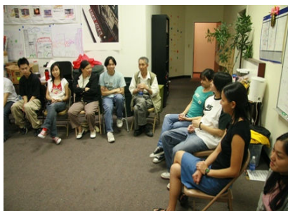
International District Housing Alliance Community Meeting

A series of community meetings and workshops at 3 elementary schools helped engage residents in identifying sources of toxics for Pacoima (CA) Beautiful . In addition, students at California State University in Northridge walked throughout the community to see and document problematic land uses. Also, the class is researching business plans, risk assessment maps and other data to provide a better understanding local sources of toxics.