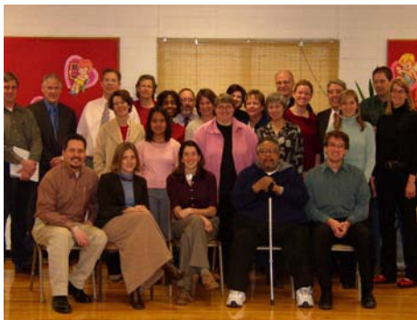
Groundwork Denver's Partnership Team

New Haven's CARE partnership successfully engaged St. Raphael's Hospital on a proposed boiler conversion program. As a result, the hospital will burn natural gas from at least April through August each year, which will reduce emissions of harmful pollutants (nitrogen oxide, sulfur dioxide and particulate matter) by more than 15 tons a year. In addition the hospital agreed to a complete Environmental Management System project at the hospital.