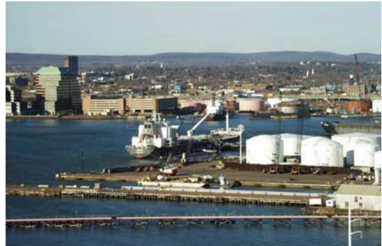
New Haven CARE Project Addresses Toxics at Port

U.S. Environmental Protection Agency's (EPA) Community Action for a Renewed Environment (CARE) program promotes local action by providing technical support and federal funding directly to community-based collaborative partnerships. CARE's continued success is evidenced by the twelve current CARE communities reporting significant second-quarter achievements in each of the four CARE process stages. So far the CARE Projects have over 210 partner organizations and have leveraged over $600,000. More detailed information about each of the twelve communities' efforts can be found inside under "CARE Communities in Action" (p. 2-4).