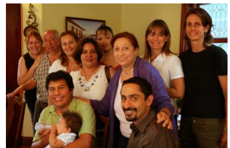
The Healthy Air for Northeast Denver partnership includes a team of community health workers, or "promotoras," who educate primarily Spanish-speaking residents about indoor air hazards.

Please visit the CARE Web site at www.epa.gov/CARE for more information.