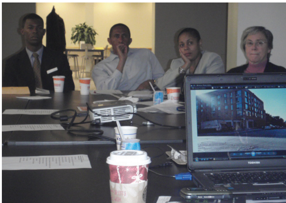
A PhotoVoice Project was used. Photos were taken of unsuccessful and successful garbage management and discussions of the problems and solutions were organized around the photos.

In this segment of the CARE project, the Collaborative built a fruitful partnership with local businesses and the Department of Sanitation to reduce garbage and pests. Businesses were engaged on garbage and pest issues through the Northern Manhattan Business Roundtable. Another PhotoVoice project was launched, this time providing business owners disposable cameras to document problems. Cameras were collected and a meeting held to discuss perceptions of the solid waste issues in the community and to collaboratively arrive at potential solutions. One complaint that was raised from, some businesses in Central Harlem was that they felt that they were being targeted for fines by the NYC Department of Sanitation.