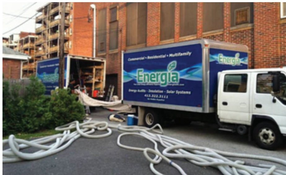
Nuestra Raices launched Energía, a green energy services company, which provides green jobs for youth.