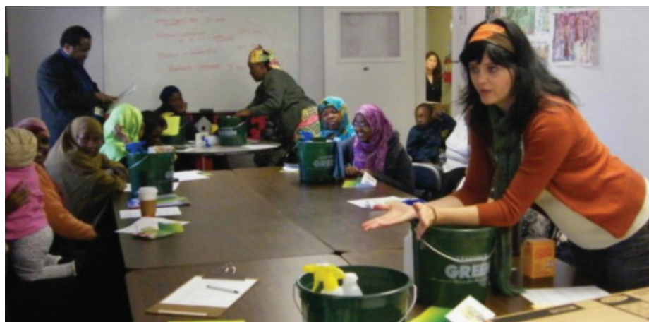
A Program Manager explains the dangers of cleaners that are purchased during one of the Healthy People, Healthy Places workshops.

Other partnerships were developed with the local business community in creating "The Guide to Green Products in North/Northeast Portland," ( http://www.jhillclinic.org/wp-content/uploads/2009/06/nne-pdx-green-guide1.pdf ) The project's Green Business Marketing Specialist asked business managers and owners for permission to collect data on green products and services that are available at their stores, such as information about green product types, prices, and sizes, product placement, promotions, and a narrative of the availability and placement