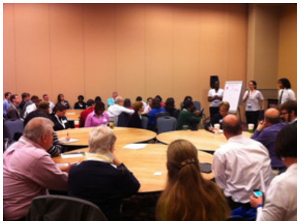
The signature of the project was engaging the community in land-use planning. Over 900 residents and other partners were involved.

community process around land-use planning with a shared commitment to make the Green Line rail train and Community Path connecting communities, a reality. With community concerns firmly in hand, Groundwork Somerville, in collaboration with the Somerville Community Health Agenda, Somerville Transportation Equity