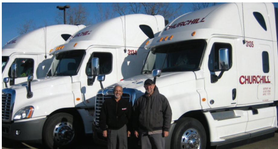
Use of pollution control technologies and replacement of old engines has led to removal of 6,000 tons annually.

which resulted in the removal of 5,000 tires from neighborhood streets; securing funding from the Michigan Department of Environmental Quality to purchase diesel emission reduction technology and replace old diesel engines for nine businesses in the Southwest Detroit area, which resulted in the removal of 140 tons of diesel emissions annually. Now the project has reduced more than 6,000 tons of diesel emissions.