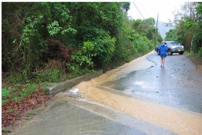
Innovative stormwater techniques were used to control runoff such as this photo shows.

and Atmospheric Administration (NOAA) and EPA for assistance. In 2007, NOAA funded a Watershed Management Plan (WMP) as a pilot watershed plan for Coral Bay. CBCC then applied for the CARE level II grant in 2008 to carry out the objectives in the WMP, resulting in the Coral Bay Watershed Management project ( http://www.coralbaycommunitycouncil.org ).