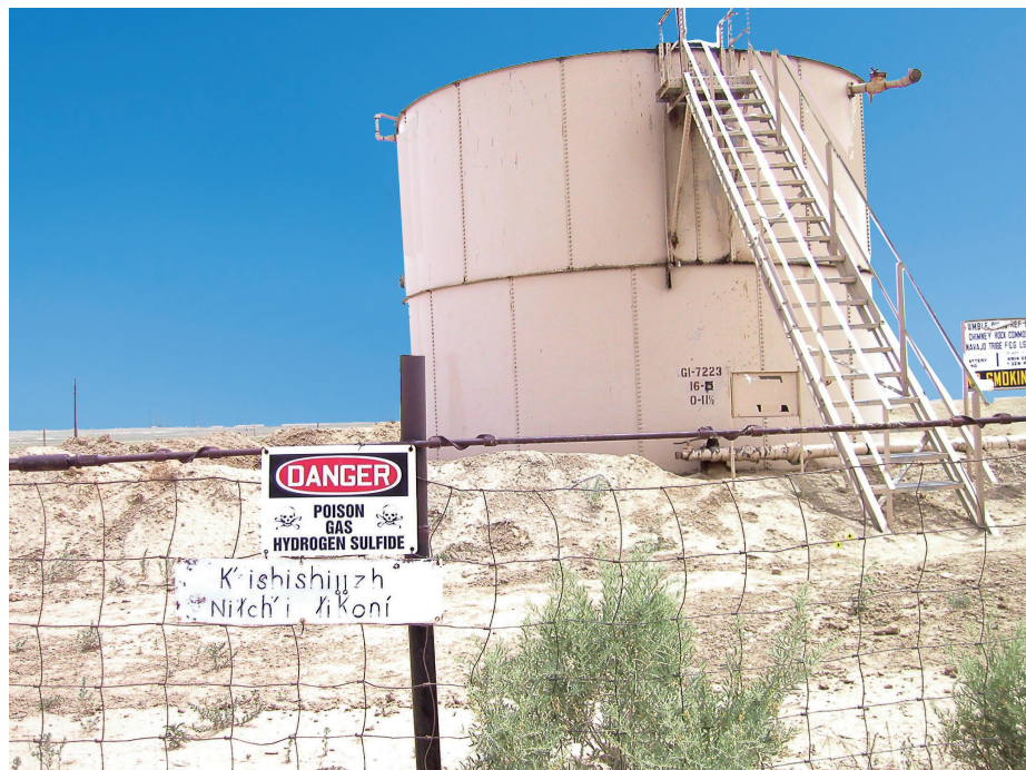
Oil and gas facilities located on northern Navajo Reservation lands.