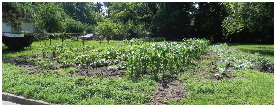
Plans are underway to convert multiple vacant lots to community green space, including parks and community gardens.