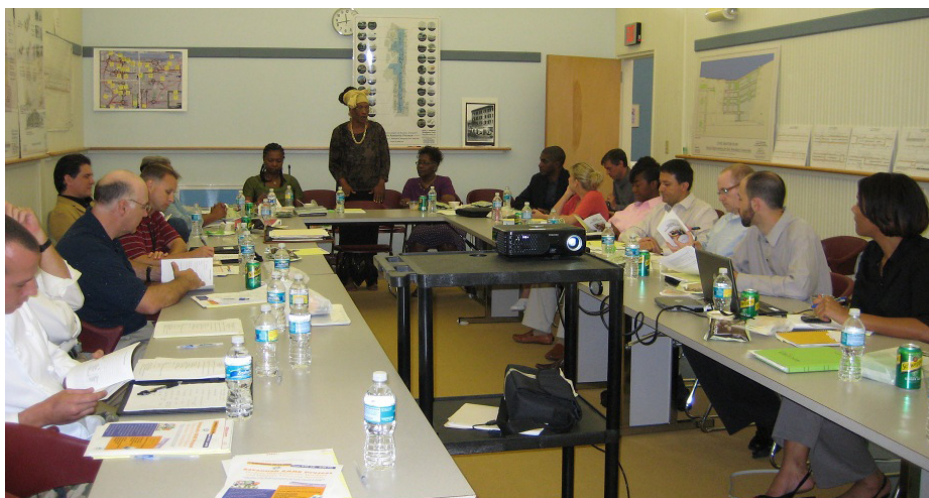
The CARE community's Business Roundtable provided a neutral forum for honest communication on voluntary measures to improve community health with industry, residents, state and local government, and others.

Finally a sustainable collaborative partnership was created that consists of a diverse cross-section of individuals representing all interests. Discussion topics address what each entity is doing on a voluntary basis and how they are taking into account the community's needs. The roundtable serves as a powerful forum for raising issues with some issues "spinning off" to be addressed by other venues. As a result of a chemical spill, the group immediately called for