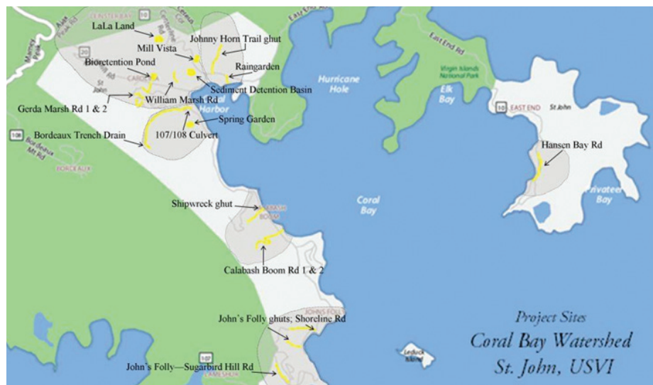
Coral Bay Watershed, St. John, United States Virgin Islands.

The CARE grant also enabled the community to take actions to improve the island's drinking water supply. In Coral Bay, rainwater is collected from roofs and stored in cisterns for use as potable water in homes and businesses. Using EPA Drinking Water standard testing, a study was done of cistern water to determine if readily available means of purifying the water could help control contaminants coming from the air and birds and other wildlife on roofs and in gutters. The study concluded that a $1,000 UV lamp purification and filtration system was an easy and cost-effective solution to purify the water. Since most people do not have these systems installed and