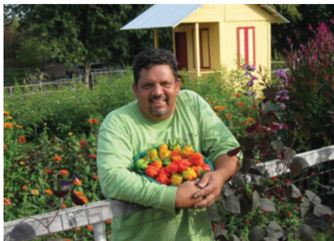
Nuestras Raíces Farmers' Market Manager sells Ajices Dulces, Puerto Rican Sweet Peppers.

Working with the city's economic development department, the Nuestras Raíces CARE project leveraged technical assistance funding for brownfield assessment of several sites. This partnership has strengthened the city's commitment to creating industrial redevelopment policies that will avoid the production of future brownfields and will instead