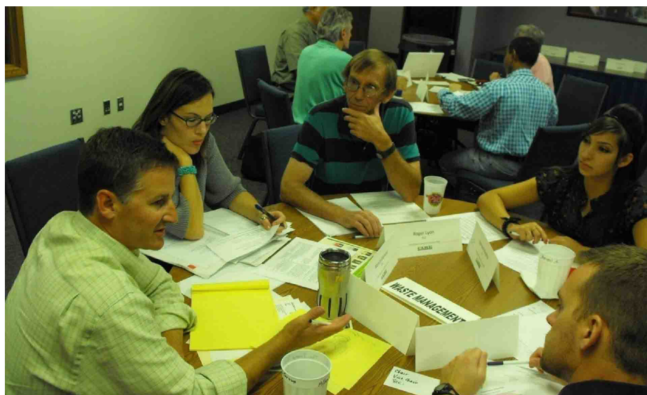
Environmental Leadership Council members discuss condensing 92 pages of environmental concerns down to 19 environmental issues.

The community discussions were part of the process that would eventually determine the community's top environmental concerns. As a result, 52 discussion groups occurred, involving more