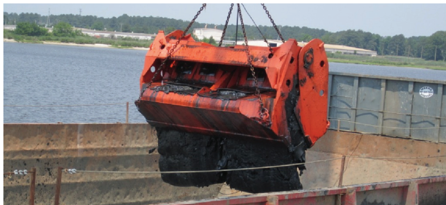
The first phase of the project included dredging 750 cubic yards of Polycyclic Aromatic Hydrocarbon (PAH) contaminated sediments and using a wetland cap to isolate river contamination. Phase II began in the summer of 2011 when the Elizabeth River Project dredged over 15,500 cubic yards of highly contaminated sediment out of the river and replaced it with clean sand.

Through the CARE process, Elizabeth River engaged industry, regulators, and citizens to develop a detailed design for dredging contaminated sediments from the river and constructing the first known living cap of its kind