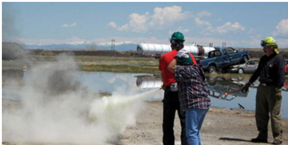
CARE community members learn how to extinguish small fires during the Community Emergency Response Team training offered in partnership with the Wind River Health Systems and Wind River All Hazards Steering Committee.

system in the CARE community. The former site of the uranium processing plant now houses a sulfuric acid manufacturing plant, that at one time operated behind locked gates. Air and water could potentially be impacted from