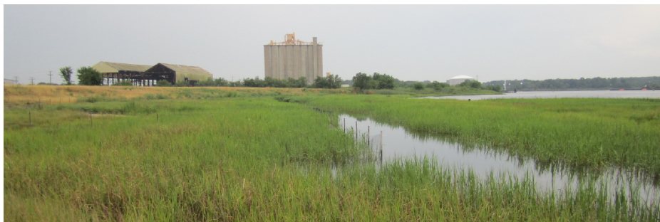
The CARE grant provided support to the Elizabeth River Project's "River Star" program which assists industries to achieve voluntary pollution prevention (P2) in air, water and soil, as well as wildlife habitat enhancement in the watershed.

During the two-year grant period, River Stars on the Southern Branch of the Elizabeth River documented the reduction of over 15,970,000 pounds of pollution and conservation or restoration of almost 79 acres of wildlife habitat enhancement. Elizabeth River is the first sediment remediation project carried out in Virginia and one of the only community-led sediment cleanup sites in the nation.