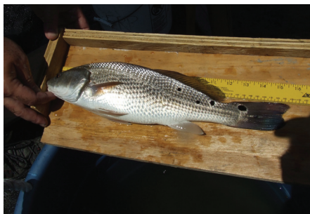
The river is already being restored with return of fish species and reduction in fish cancer rates.

Sediment cleanup has always been Elizabeth River Project's main focus since it was known that the river could not recover unless the contamination on the bottom of the river was remediated. These sediments have resulted in 70