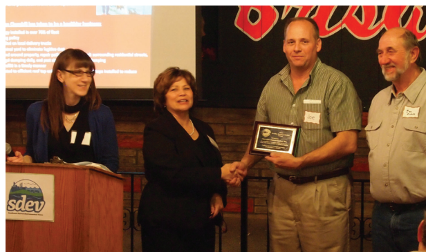
One company receiving the "Healthy Home Partner Award" for investing over $2 million in improvements to make its facility and equipment more energy efficient and for reducing waste and pollution.

The Healthy Homes Project is providing risk reduction tools to households at highest risk for lead poisoning. Homes with recorded lead poisonings in Southwest Detroit and South Dearborn are being provided tools to address lead poisoning, asthma and breathing problems. Over one third of the population of these communities are children. To date, 60 healthy homes visits have been completed with high risk families in Southwest Detroit.