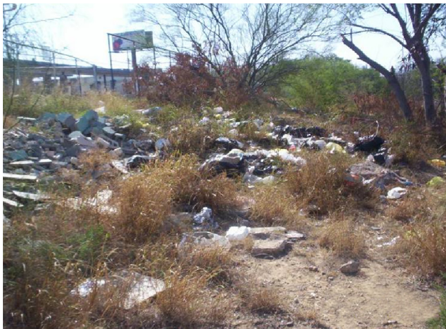
Over 900 citations for illegal dumping helped the city clean up.