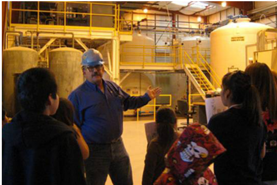
ChemTrade Logistics is a local producer of sulfuric acid and is located on the previous uranium mill processing site in the CARE community. ChemTrade opened their doors to the community and as part of the "hot spot" tours, WRA brought youth and elders to the ChemTrade facility.

Although flexibility is built into the CARE process, this process is fundamentally a linear process that starts at one point and ends at another, which is not how decisions were made in the Wind River community. The community decision-making process that emerged in this community was