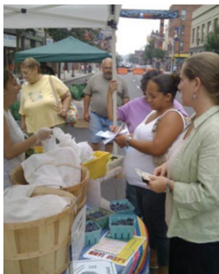
Nuestra Raices helped start local food businesses, creating jobs. Its network of farmers markets also provided increased access to produce by low-income groups by accepting SNAP/EBT cards.

CARE grantee Nuestras Raíces has built a community health coalition of diverse partners to address the multiple environmental health risks facing Holyoke's environmental justice communities and the city at large. The CARE project focused on risk factors to the community related to indoor and outdoor air quality, water quality and mercury contamination from eating fish from the Connecticut River, and