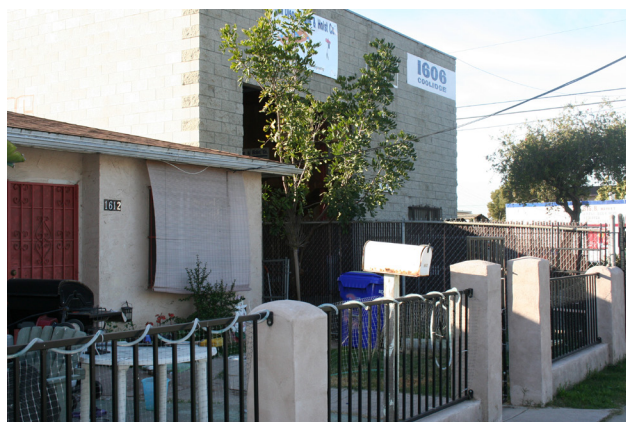
A common site: Residences mixed in with industry and small businesses including auto-body repair shops.

EHC also provides leadership training through SALTA (Salud Ambiental Lideres Tomando Acción – Environmental Health Leaders Taking Action) where skills for political advocacy and strategy, group organizing, and communications strategies are taught. Members who become very involved can become members of one of EHC’s Community Action Teams (CAT), which guide the development and implementation of community strategies.