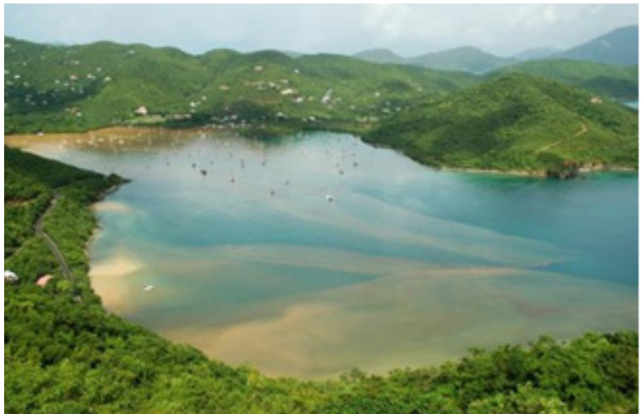
Addressing sediment plumes into Coral Bay's coral reef habitats was a priority of the Coral Bay Community Council.