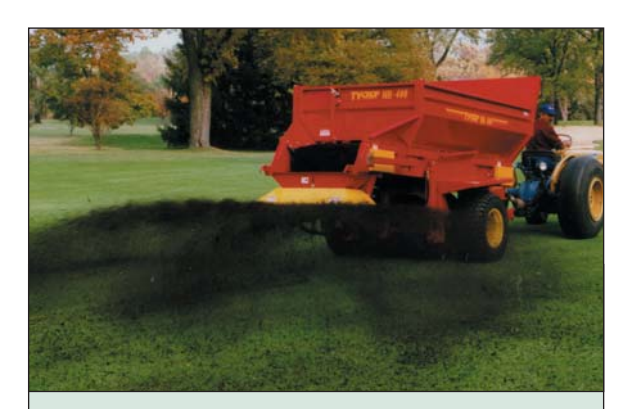
Compost - An On-Par Alternative

The soil on the North Shore Country Club (Glenview, Illinios) golf course had elevated sodium levels—too high to maintain quality turf. Standard procedure called for the installation of a wellto solve this problem, but that solution came with a quarter million dollar price tag. With a little research, North Shore found compost to be the economical alternative to enhance the quality of its soil.