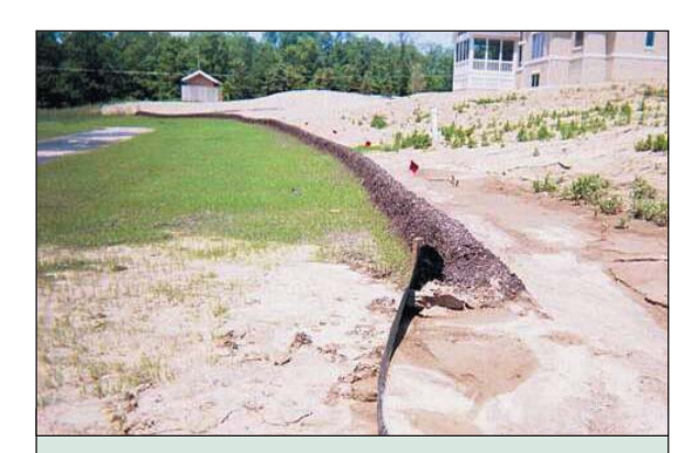
This filter berm made from compost demonstrates how well the organic material helps retain runoff in comparison to a typical silt fence in the lower portion of the photo.