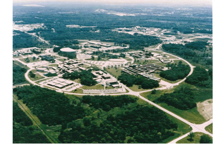
Argonne National Laboratory, one of the U.S. government's oldest and largest science and engineering research facilities, is at the forefront in implementing new ways to sustainable buildings practices.

The challenge—to make Federal buildings more sustainable—begins in a context of hundreds of thousands of diverse buildings, serving unique purposes, and owned by numerous agencies, with significant environmental impacts and the opportunity for improvement.